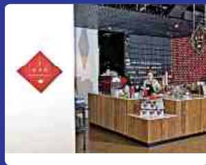
T Bar Rundle Place Cafe & Coffee Shop