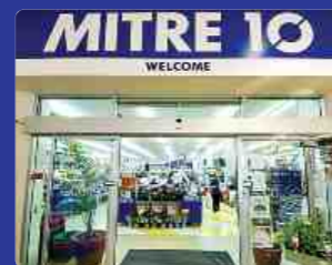
Mitre 10 Hardware & Trade Centre