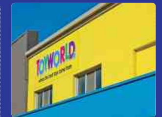
Toy World Children's Toys & Bikes