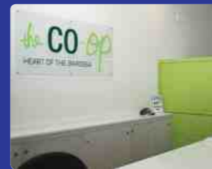
Barossa Co-op Supermarket, Department, Clothing, Sporting, Giftware