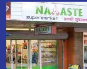
Namaste Indian Supermarket & Convenience Store