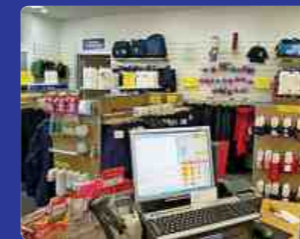
Trinity College School Clothing Store & Sports Store