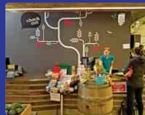
Wild Thyme Cafe & Organic Supermarket