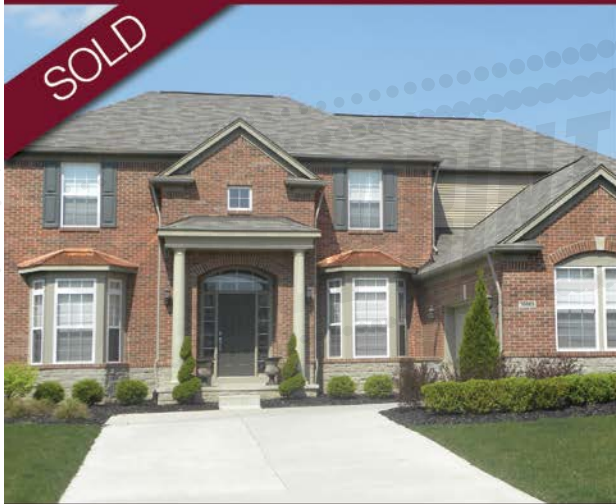
Arcadia Ridge Home Sold In Less Than 2 Weeks!