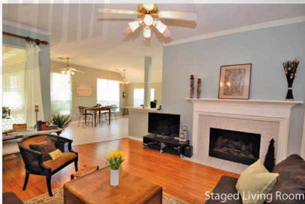
Staged Living Room

Free Home Staging Assistance with each new listing. CALL TODAY!