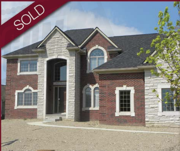
Sold In 48 Hours!