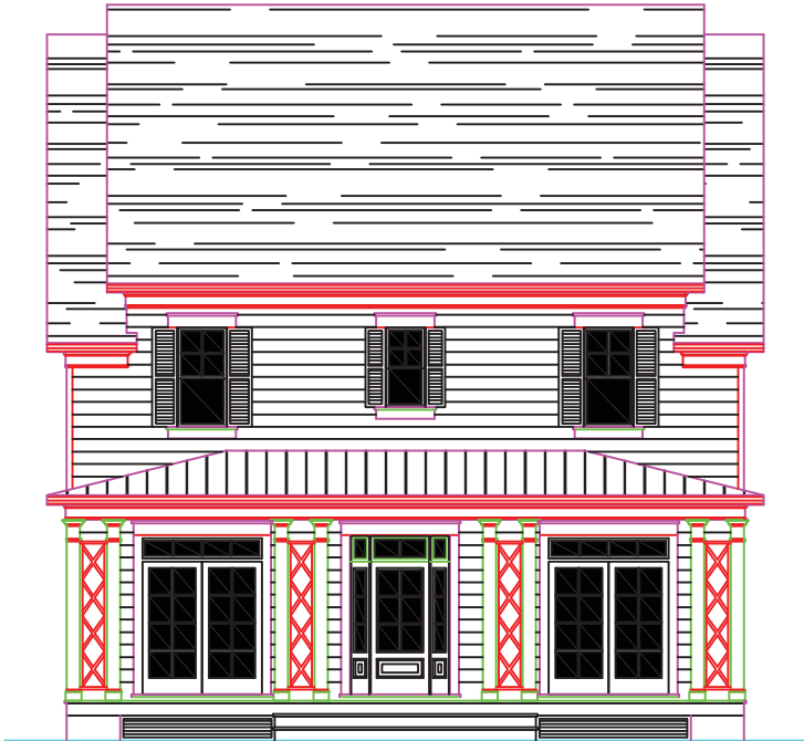
FRONT ELEVATION 'A'