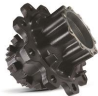
O.E Ref 1818003 (Not pictured) / 1812161