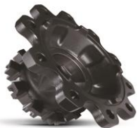
O.E Ref 1391615