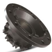
O.E Ref 1818004