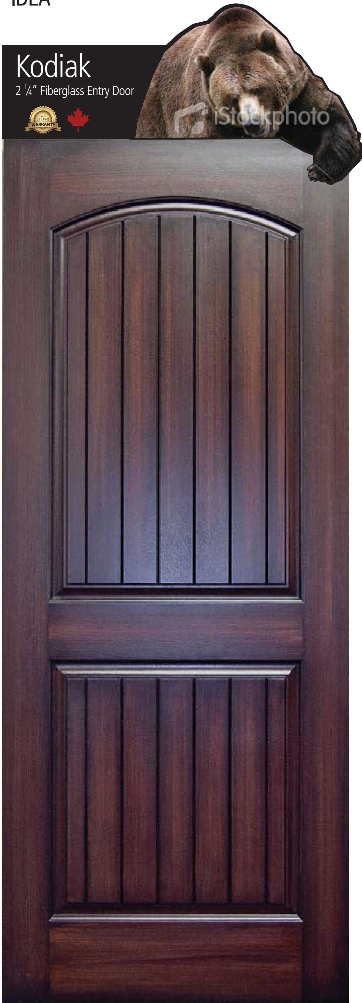
Kodiak Top Of Door Display Sign "IDEA"