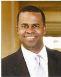
KASIM REED MAYOR