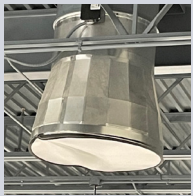
DAMAGED TUBULAR DAYLIGHTING UNIT

Tubular Daylighting Devices (TDDs) are the perfect source of diffused natural light in gymnasiums and rec centers.