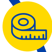
Figure out your Who, What, Why, How to gain a deeper understanding of yourself and discover your short and long term goals.