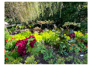
Overland Park Arboretum