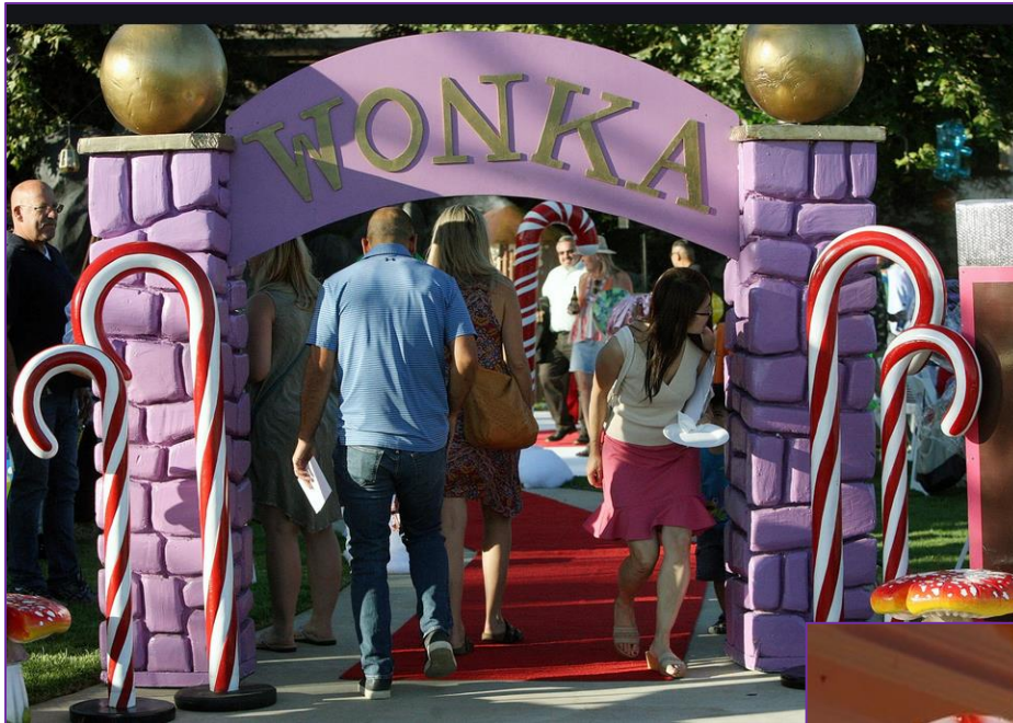
Entrance to the "Chocolate Factory"