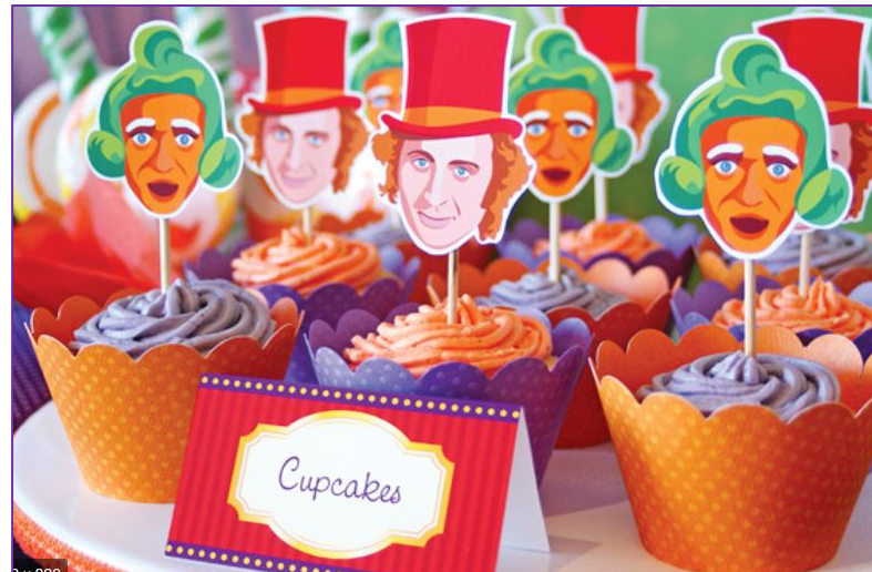
Bake sale cupcake picks