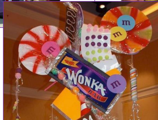
Aluminum foil wrapped wood blocks with printed sleeves like Wonka bars