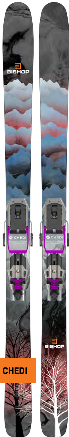
BMF/3 + CHEDI