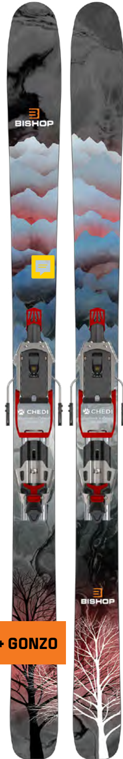
BMF/R + GONZO