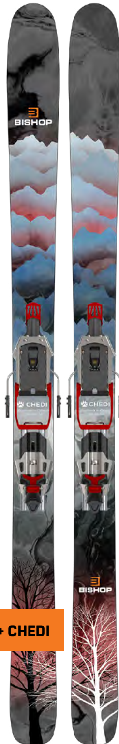
BMF/R + CHEDI