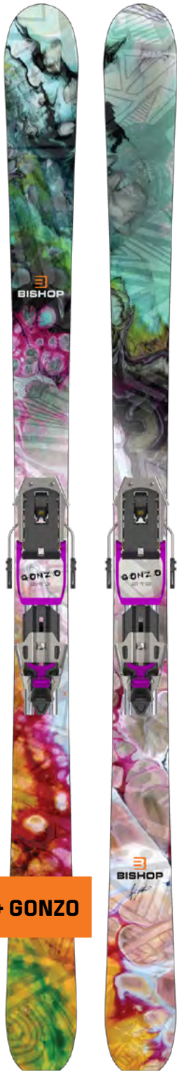
BMF/3 + GONZO