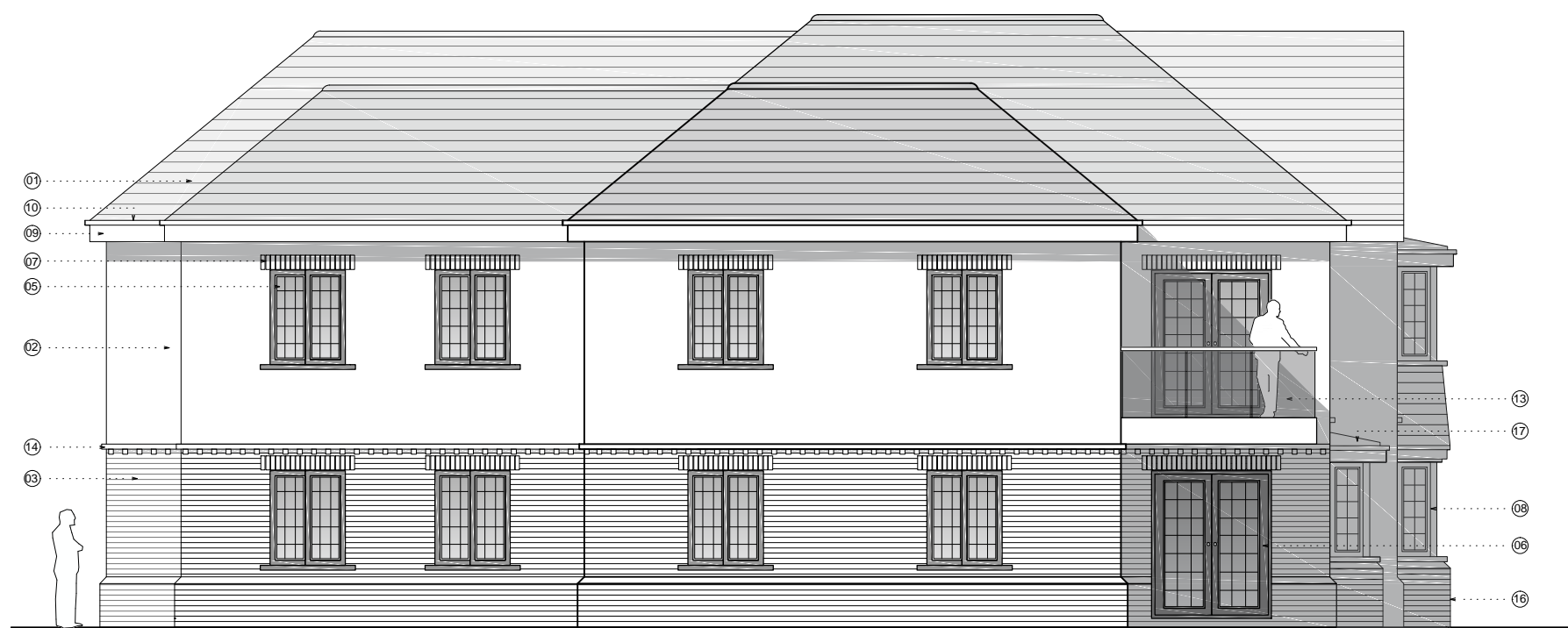
02 PROPOSED SOUTH ELEVATION 2003 Scale: 1:100