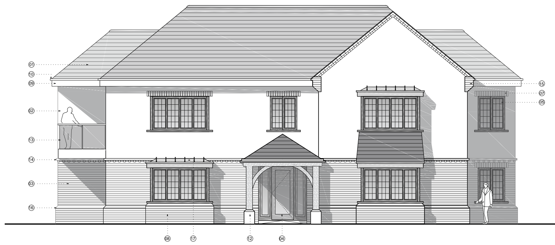
01 PROPOSED EAST ELEVATION 2003 Scale: 1:100