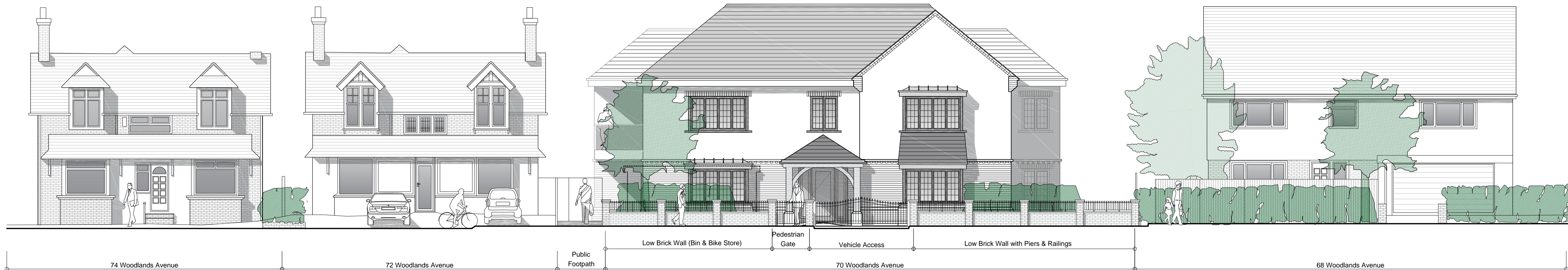
05 PROPOSED STREET ELEVATION 2003 Scale: 1:100