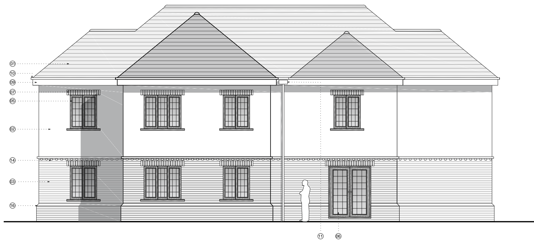
03 PROPOSED WEST ELEVATION 2003 Scale: 1:100