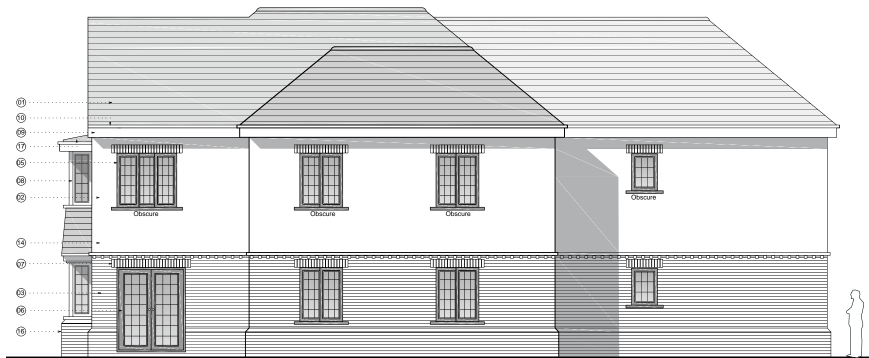
04 PROPOSED NORTH ELEVATION 2003 Scale: 1:100