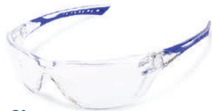
Clear Part n° 3SC9217