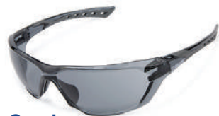
Smoke Part n° 3SS9217