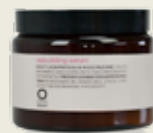
REBUILDING SERUM 500 ml

WITH BIODYNAMIC IRIS, ORGANIC BASIL, PHYTOKERATIN, CERAMIDES, MINERAL SALTS, ETHICAL TEAK AND MAHOGANY.