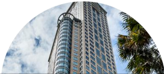
Your Office Community of 1.5 Million