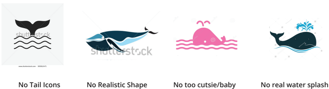
No Tail Icons No Realistic Shape No too cutsie/baby No real water splash