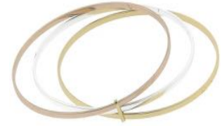
GOLD LAYERED 07.63.0162.05 TRIO BANGLE, TRI TONE (SIZE 5 - 2.50 INCHES DIAMETER)