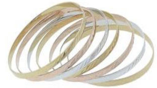
GOLD LAYERED 116.009.05 SEMANARIO BANGLE, TRI TONE (SIZE 5 - 2.50 INCHES DIAMETER)