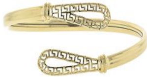
GOLD LAYERED 5.230.011 INDIVIDUAL BANGLE, GREEK KEY DESIGN, GOLD TONE