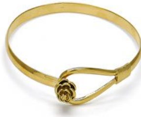
GOLD LAYERED 07.156.0004.06 INDIVIDUAL BANGLE, FLOWER DESIGN, POLISHED FINISH, GOLD TONE (17 MM THICKNESS, SIZE 6 - 2.75 INCHES DIAMETER)