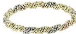
GOLD LAYERED 07.54.0009.06 INDIVIDUAL BANGLE, DIAMOND CUTTING FINISH, TRI TONE (SIZE 6 - 2.75 INCHES DIAMETER)