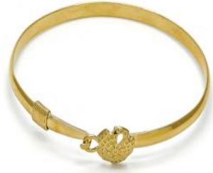
GOLD LAYERED 07.192.0014.06 INDIVIDUAL BANGLE, FLOWER DESIGN, POLISHED FINISH, GOLD TONE (12 MM THICKNESS, SIZE 6 - 2.75 INCHES DIAMETER)