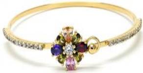
GOLD LAYERED 07.97.0045 INDIVIDUAL BANGLE, FLOWER DESIGN, WITH CUBIC ZIRCONIA, GOLD TONE