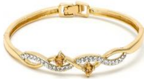
GOLD LAYERED 07.171.0024 INDIVIDUAL BANGLE, INFINITE DESIGN, WITH DARK CHAMPAGNE AND WHITE CUBIC ZIRCONIA AND WHITE CRYSTAL, POLISHED FINISH, GOLD TONE (3 MM THICKNESS, SIZE 4 - 2.