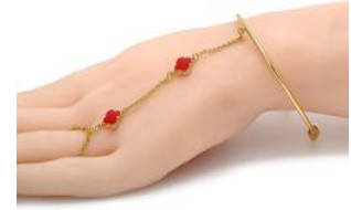
GOLD LAYERED 07.60.0003 INDIVIDUAL BANGLE, FLOWER DESIGN, RED ENAMEL FINISH, GOLD TONE (55 MM THICKNESS, ONE SIZE FITS ALL)