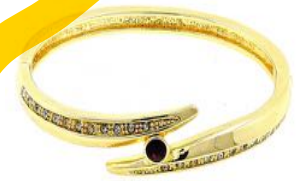
GOLD LAYERED 07.59.0052.05 INDIVIDUAL BANGLE, WITH AMETHYST AND WHITE CRYSTAL, POLISHED FINISH, GOLD TONE (50 MM THICKNESS, SIZE 5 - 2.50 INCHES DIAMETER)