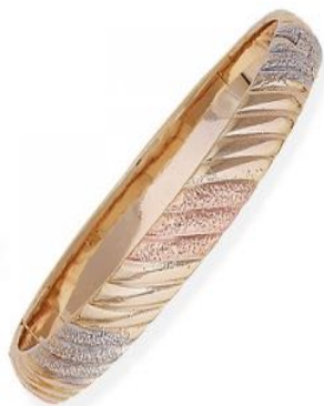
GOLD LAYERED 5.231.008 INDIVIDUAL BANGLE, DIAMOND CUTTING FINISH, GOLD LAYERED 5.231.009 INDIVIDUAL BANGLE, WITH CUBIC ZIRCONIA, GOLD TONE