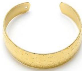
GOLD LAYERED 07.101.0005 INDIVIDUAL BANGLE, POLISHED FINISH, GOLD TONE (ONE SIZE FITS ALL)