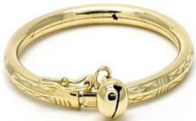
GOLD LAYERED 07.59.0046 INDIVIDUAL BANGLE, GOLD TONE (ONE SIZE FITS ALL)