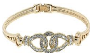
GOLD LAYERED 07.38.0025 INDIVIDUAL BANGLE, LOVE KNOT DESIGN, WITH WHITE CUBIC ZIRCONIA, GOLD TONE