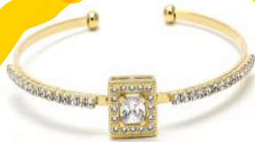
GOLD LAYERED 07.97.0057 INDIVIDUAL BANGLE, WITH CUBIC ZIRCONIA, GOLD TONE