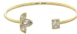
GOLD LAYERED 07.97.0028 INDIVIDUAL BANGLE, LEAF DESIGN, WITH WHITE CUBIC ZIRCONIA, POLISHED FINISH, GOLD TONE (ONE SIZE FITS ALL)