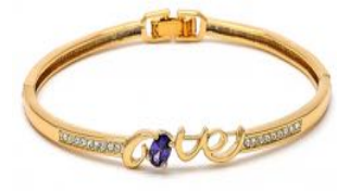
GOLD LAYERED 07.171.0019.3 INDIVIDUAL BANGLE, LOVE DESIGN, WITH AMETHYST AND WHITE CUBIC ZIRCONIA AND WHITE CRYSTAL, POLISHED FINISH, GOLD TONE (3 MM THICKNESS, SIZE 5 - 2.50 INCHES