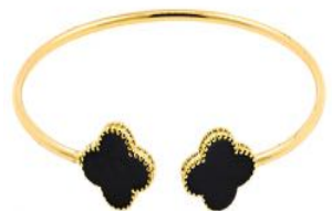
GOLD LAYERED 07.60.0002 INDIVIDUAL BANGLE, FLOWER DESIGN, BLACK ENAMEL FINISH, GOLD TONE (14 MM THICKNESS, ONE SIZE FITS ALL)