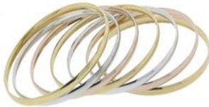
GOLD LAYERED 5.232.005.05 SEMANARIO BANGLE, POLISHED FINISH, TRI TONE (SIZE 5 - 2.50 INCHES DIAMETER)