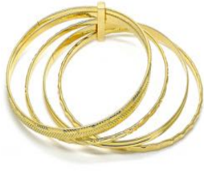
GOLD LAYERED 07.59.0064.06 SET BANGLE, DIAMOND CUTTING FINISH, GOLD TONE (18 MM THICKNESS, SIZE 6 - 2.75 INCHES DIAMETER)