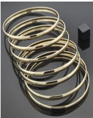
GOLD LAYERED 5.232.004.06 SEMANARIO BANGLE, GOLD TONE (SIZE 6 - 2.75 INCHES DIAMETER)