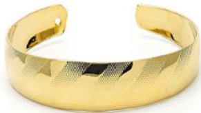
GOLD LAYERED 07.101.0004 INDIVIDUAL BANGLE, MATTE FINISH, GOLD TONE (ONE SIZE FITS ALL)