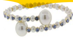
GOLD LAYERED 07.63.0149 INDIVIDUAL BANGLE, BALL DESIGN, WITH PEARL, GOLD TONE