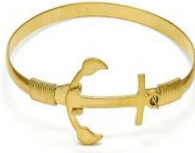
GOLD LAYERED 07.192.0012.06 INDIVIDUAL BANGLE, ANCHOR DESIGN, POLISHED FINISH, GOLD TONE (25 MM THICKNESS, SIZE 6 - 2.75 INCHES DIAMETER)