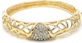
GOLD LAYERED 07.59.0043 INDIVIDUAL BANGLE, WITH CUBIC ZIRCONIA, GOLD TONE