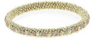
GOLD LAYERED 07.54.0008.06 INDIVIDUAL BANGLE, DIAMOND CUTTING FINISH, TRI TONE (SIZE 6 - 2.75 INCHES DIAMETER)