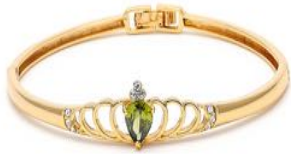
GOLD LAYERED 07.171.0018 INDIVIDUAL BANGLE, TEARDROP DESIGN, WITH DARK PERIDOT AND WHITE CUBIC ZIRCONIA AND WHITE CRYSTAL, POLISHED FINISH, GOLD TONE (3 MM THICKNESS, SIZE 5 - 2.50