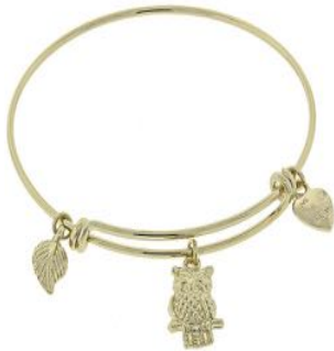
GOLD LAYERED 07.63.0122 INDIVIDUAL BANGLE, OWL AND LEAF DESIGN, DIAMOND CUTTING FINISH, GOLD TONE (ONE SIZE FITS ALL)