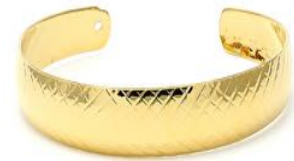
GOLD LAYERED 07.101.0003 INDIVIDUAL BANGLE, BEE DESIGN, POLISHED FINISH, GOLD TONE (ONE SIZE FITS ALL)