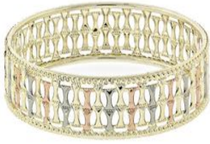
GOLD LAYERED 07.54.0001.06 INDIVIDUAL BANGLE, TRI TONE (SIZE 6 - 2.75 INCHES DIAMETER)