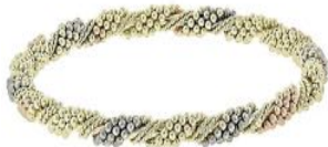
GOLD LAYERED 07.54.0009.05 INDIVIDUAL BANGLE, DIAMOND CUTTING FINISH, TRI TONE (SIZE 5 - 2.50 INCHES DIAMETER)