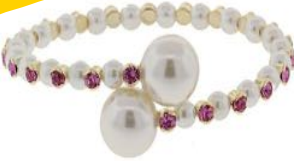
GOLD LAYERED 07.63.0147 INDIVIDUAL BANGLE, BALL DESIGN, WITH PEARL, GOLD TONE