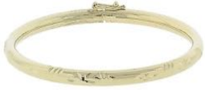
GOLD LAYERED 5.231.018 INDIVIDUAL BANGLE, DIAMOND CUTTING FINISH, GOLD TONE (4 MM THICKNESS, SIZE 5 - 2.50 INCHES DIAMETER)