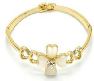
GOLD LAYERED 07.65.0213.04 INDIVIDUAL BANGLE, FLOWER AND HEART DESIGN, WITH WHITE AND WHITE OPAL AND WHITE CRYSTAL, POLISHED FINISH, GOLD TONE (4 MM THICKNESS, SIZE 4 - 2.25 INCHES)