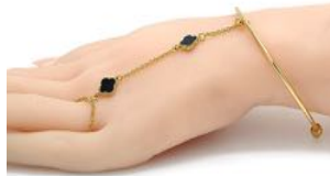
GOLD LAYERED 07.60.0003.2 INDIVIDUAL BANGLE, FLOWER DESIGN, BLACK ENAMEL FINISH, GOLD TONE (55 MM THICKNESS, ONE SIZE FITS ALL)