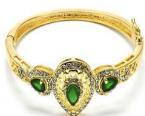
GOLD LAYERED 07.91.0048.05 INDIVIDUAL BANGLE, TEARDROP DESIGN, WITH PERIDOT AND WHITE CUBIC ZIRCONIA AND WHITE CRYSTAL, POLISHED FINISH, GOLD TONE (60 MM THICKNESS, SIZE 5 - 2.50 I