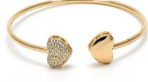
GOLD LAYERED 07.198.0002 INDIVIDUAL BANGLE, HEART DESIGN, WITH MICRO PAVE, GOLD TONE (ONE SIZE FITS ALL)