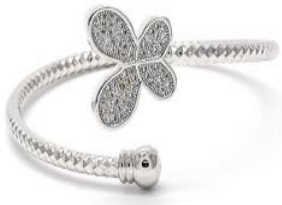
GOLD LAYERED 07.192.0002.1 INDIVIDUAL BANGLE, BUTTERFLY AND BALL DESIGN, WITH WHITE MICRO PAVE, DIAMOND CUTTING FINISH, RHODIUM TONE (3 MM THICKNESS, ONE SIZE FITS ALL)