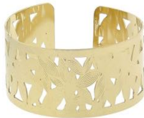
GOLD LAYERED 5.232.013 INDIVIDUAL BANGLE, LEAF DESIGN, DIAMOND CUTTING FINISH, GOLD TONE