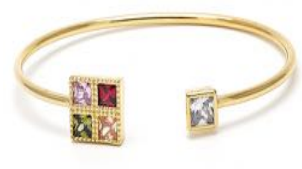
GOLD LAYERED 07.97.0056 INDIVIDUAL BANGLE, WITH CUBIC ZIRCONIA, GOLD TONE