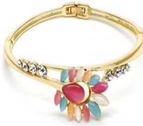
GOLD LAYERED 07.65.0209.1.05 INDIVIDUAL BANGLE, TEARDROP AND LEAF DESIGN, WITH MULTICOLOR AND WHITE OPAL AND WHITE CRYSTAL, POLISHED FINISH, GOLD TONE (21 MM THICKNESS, SIZE 5 - 2.