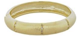
GOLD LAYERED 07.59.0013 INDIVIDUAL BANGLE, BAMBOO DESIGN, WITH CRYSTAL, GOLD TONE