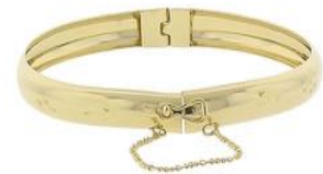
GOLD LAYERED 117.003.06 INDIVIDUAL BANGLE, DIAMOND CUTTING FINISH, GOLD TONE (SIZE 6 - 2.75 INCHES DIAMETER)