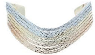
GOLD LAYERED 07.156.0023.1 INDIVIDUAL BANGLE, DIAMOND CUTTING FINISH, TRI TONE (13 MM THICKNESS, ONE SIZE FITS ALL)