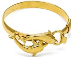
GOLD LAYERED 07.192.0020.03 INDIVIDUAL BANGLE, DOLPHIN DESIGN, POLISHED FINISH, GOLD TONE (17 MM THICKNESS, SIZE 3 - 2.00 INCHES DIAMETER)