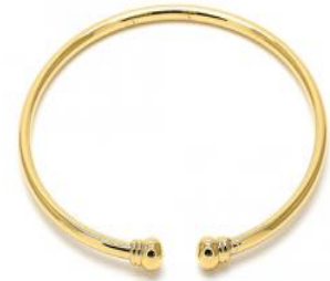
GOLD LAYERED 07.156.0042 INDIVIDUAL BANGLE, GOLD TONE