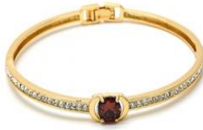
GOLD LAYERED 07.171.0025.3 INDIVIDUAL BANGLE, WITH GARNET AND WHITE CUBIC ZIRCONIA, POLISHED FINISH, GOLD TONE (9 MM THICKNESS, SIZE 3 - 2.00 INCHES DIAMETER)