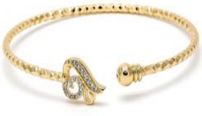
GOLD LAYERED 07.193.0013 INDIVIDUAL BANGLE, HEART DESIGN, WITH WHITE CRYSTAL, DIAMOND CUTTING FINISH, GOLD TONE (2 MM THICKNESS, ONE SIZE FITS ALL)