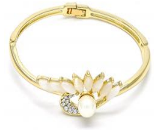
GOLD LAYERED 07.65.0215.05 INDIVIDUAL BANGLE, WITH WHITE AND IVORY OPAL AND IVORY PEARL, POLISHED FINISH, GOLD TONE (21 MM THICKNESS, SIZE 5 - 2.50 INCHES DIAMETER)