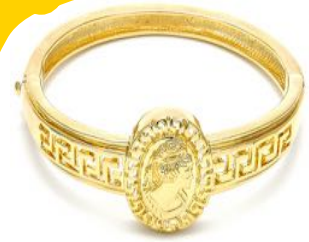
GOLD LAYERED 07.59.0057.05 INDIVIDUAL BANGLE, GREEK KEY DESIGN, POLISHED FINISH, GOLD TONE (60 MM THICKNESS, SIZE 5 - 2.50 INCHES DIAMETER)