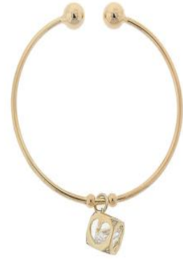
GOLD LAYERED 07.171.0016 INDIVIDUAL BANGLE, HEART DESIGN, WITH WHITE CUBIC ZIRCONIA, GOLD TONE