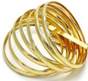
GOLD LAYERED 07.59.0050.06 SEMANARIO BANGLE, DIAMOND CUTTING FINISH, GOLD TONE (60 MM THICKNESS, SIZE 6 - 2.75 INCHES DIAMETER)