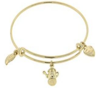
GOLD LAYERED 07.63.0121 INDIVIDUAL BANGLE DESIGN, GOLD TONE