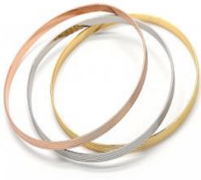
GOLD LAYERED 5.233.004 TRIO BANGLE, POLISHED FINISH, TRI TONE