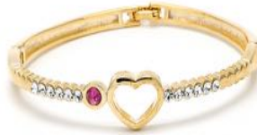
GOLD LAYERED 07.171.0020 INDIVIDUAL BANGLE, HEART DESIGN, WITH FUCHSIA AND WHITE CRYSTAL, POLISHED FINISH, GOLD TONE (5 MM THICKNESS, SIZE 5 - 2.50 INCHES DIAMETER)