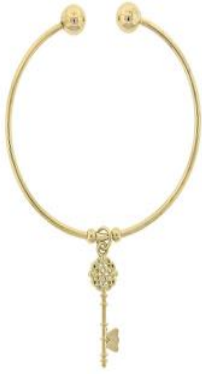
GOLD LAYERED 07.63.0140 INDIVIDUAL BANGLE, GREEK KEY DESIGN, GOLD TONE