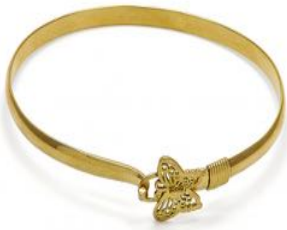
GOLD LAYERED 07.192.0025.06 INDIVIDUAL BANGLE, BUTTERFLY DESIGN, POLISHED FINISH, GOLD TONE (17 MM THICKNESS, SIZE 6 - 2.75 INCHES DIAMETER)