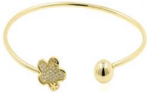
GOLD LAYERED 07.204.0002 INDIVIDUAL BANGLE, FLOWER AND BALL DESIGN, WITH WHITE MICRO PAVE, POLISHED FINISH, GOLD TONE (55 MM THICKNESS, ONE SIZE FITS ALL)