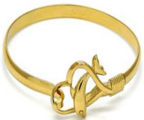
GOLD LAYERED 07.192.0024.03 INDIVIDUAL BANGLE, DOLPHIN AND HEART DESIGN, POLISHED FINISH, GOLD TONE (19 MM THICKNESS, SIZE 3 - 2.00 INCHES DIAMETER)