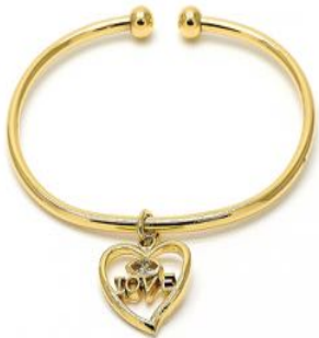
GOLD LAYERED 07.168.0001 INDIVIDUAL BANGLE, HEART AND LOVE DESIGN, WITH WHITE CRYSTAL, POLISHED FINISH, GOLD TONE (ONE SIZE FITS ALL)