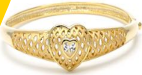
GOLD LAYERED 07.59.0039.1 INDIVIDUAL BANGLE, HEART DESIGN, WITH WHITE CRYSTAL, MATTE FINISH, GOLD TONE (17 MM THICKNESS, SIZE 5 - 2.50 INCHES DIAMETER)