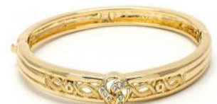
GOLD LAYERED 07.91.0039 INDIVIDUAL BANGLE, WITH CRYSTAL, GOLD TONE