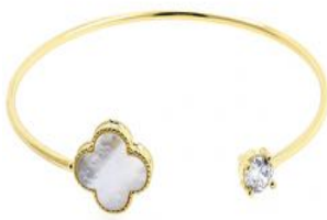
GOLD LAYERED 07.195.0013.1 INDIVIDUAL BANGLE, FLOWER DESIGN, WITH WHITE AND WHITE OPAL AND WHITE CUBIC ZIRCONIA, POLISHED FINISH, GOLD TONE (2 MM THICKNESS, ONE SIZE FITS ALL)