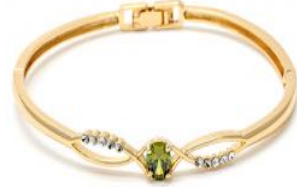
GOLD LAYERED 07.171.0027.2 INDIVIDUAL BANGLE, WITH DARK PERIDOT AND WHITE CUBIC ZIRCONIA AND WHITE CRYSTAL, POLISHED FINISH, GOLD TONE (3 MM THICKNESS, SIZE 5 - 2.50 INCHES DIAMETER)