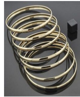
GOLD LAYERED 5.232.004.05 SEMANARIO BANGLE, GOLD TONE (SIZE 5 - 2.50 INCHES DIAMETER)