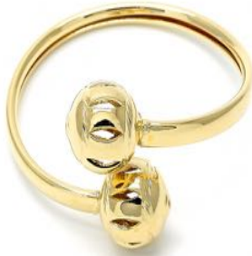
GOLD LAYERED 07.63.0087 INDIVIDUAL BANGLE, TRI TONE (ONE SIZE FITS ALL)