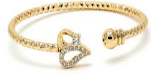
GOLD LAYERED 07.193.0012.1 INDIVIDUAL BANGLE, HEART AND BALL DESIGN, WITH WHITE CUBIC ZIRCONIA, DIAMOND CUTTING FINISH, GOLD TONE (2 MM THICKNESS, ONE SIZE FITS ALL)