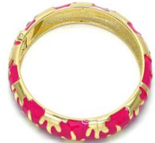
GOLD LAYERED 07.240.0002.1.05 INDIVIDUAL BANGLE, PINK ENAMEL FINISH, GOLD TONE (10 MM THICKNESS, SIZE 5 - 2.50 INCHES DIAMETER)