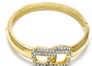
GOLD LAYERED 07.59.0060.05 INDIVIDUAL BANGLE, WITH WHITE CRYSTAL, POLISHED FINISH, TWO TONE (SIZE 5 - 2.50 INCHES DIAMETER)