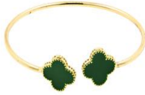
GOLD LAYERED 07.60.0002.2 INDIVIDUAL BANGLE, FLOWER DESIGN, GREEN ENAMEL FINISH, GOLD TONE (14 MM THICKNESS, ONE SIZE FITS ALL)