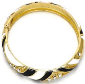
GOLD LAYERED 07.240.0003.04 INDIVIDUAL BANGLE, WITH WHITE CRYSTAL, MULTICOLOR ENAMEL FINISH, GOLD TONE (8 MM THICKNESS, SIZE 4 - 2.25 INCHES DIAMETER)