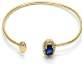
GOLD LAYERED 07.156.0048.1 INDIVIDUAL BANGLE, WITH SAPPHIRE BLUE AND WHITE CUBIC ZIRCONIA AND WHITE CRYSTAL, POLISHED FINISH, GOLD TONE (2 MM THICKNESS, ONE SIZE FITS ALL)