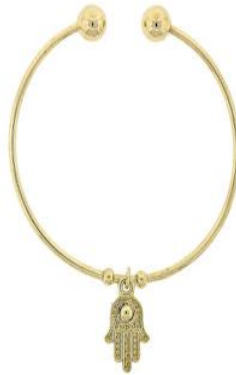
GOLD LAYERED 07.63.0137 INDIVIDUAL BANGLE, HAND OF GOD DESIGN, POLISHED FINISH, GOLD TONE