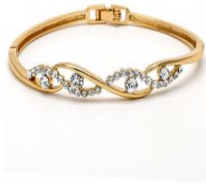
GOLD LAYERED 07.171.0031 INDIVIDUAL BANGLE, WITH CRYSTAL, GOLD TONE