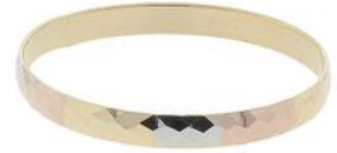
GOLD LAYERED 03.63.0022 INDIVIDUAL BANGLE, DIAMOND CUTTING