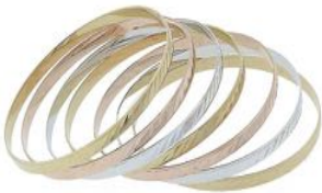
GOLD LAYERED 116.009.06 SEMANARIO BANGLE, TRI TONE (SIZE 6 - 2.75 INCHES DIAMETER)