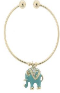
GOLD LAYERED 07.38.0056.6 INDIVIDUAL BANGLE, ELEPHANT DESIGN, ENAMEL FINISH, GOLD TONE