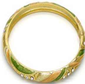
GOLD LAYERED 07.240.0003.1.04 INDIVIDUAL BANGLE, WITH WHITE CRYSTAL, MULTICOLOR ENAMEL FINISH, GOLD TONE (8 MM THICKNESS, SIZE 4 - 2.25 INCHES DIAMETER)