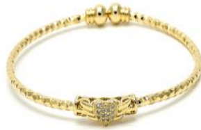
GOLD LAYERED 07.63.0176 INDIVIDUAL BANGLE, HEART AND GREEK KEY DESIGN, WITH MICRO PAVE, DIAMOND CUTTING FINISH, GOLD TONE