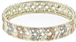
GOLD LAYERED 07.54.0003.06 INDIVIDUAL BANGLE, TRI TONE (SIZE 6 - 2.75 INCHES DIAMETER)