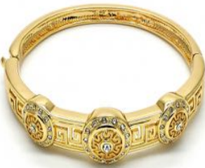
GOLD LAYERED 07.91.0046.05 INDIVIDUAL BANGLE, GREEK KEY DESIGN, WITH WHITE CRYSTAL, POLISHED FINISH, GOLD TONE (60 MM THICKNESS, SIZE 5 - 2.50 INCHES DIAMETER)