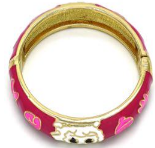
GOLD LAYERED 07.240.0007.3.03 INDIVIDUAL BANGLE, RED ENAMEL FINISH, GOLD TONE (10 MM THICKNESS, SIZE 3 - 2.00 INCHES DIAMETER)