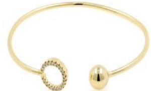
GOLD LAYERED 07.204.0004 INDIVIDUAL BANGLE, BALL DESIGN, WITH WHITE MICRO PAVE, POLISHED FINISH, GOLD TONE (55 MM THICKNESS, ONE SIZE FITS ALL)