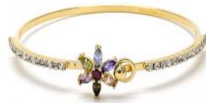
GOLD LAYERED 07.97.0017.1 INDIVIDUAL BANGLE, FLOWER DESIGN, WITH MULTICOLOR CUBIC ZIRCONIA, POLISHED FINISH, GOLD TONE (2 MM THICKNESS, SIZE 3 - 2.00 INCHES DIAMETER)