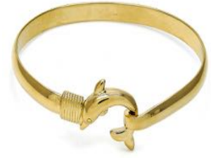
GOLD LAYERED 07.192.0013.03 INDIVIDUAL BANGLE, DOLPHIN DESIGN, POLISHED FINISH, GOLD TONE (14 MM THICKNESS, SIZE 3 - 2.00 INCHES DIAMETER)