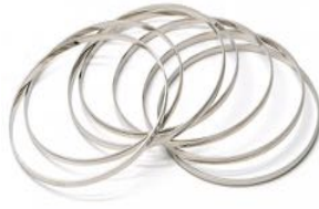
GOLD LAYERED 5.232.002.1.03 SEMANARIO BANGLE, POLISHED FINISH,