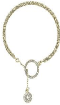
GOLD LAYERED 07.91.0027 INDIVIDUAL BANGLE, WITH MICRO PAVE, GOLD TONE