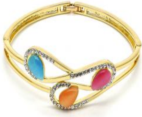
GOLD LAYERED 07.65.0208.05 INDIVIDUAL BANGLE, TEARDROP DESIGN, WITH MULTICOLOR AND WHITE OPAL AND WHITE CRYSTAL, POLISHED FINISH, GOLD TONE (20 MM THICKNESS, SIZE 5 - 2.50 INCHES D