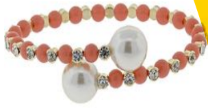
GOLD LAYERED 07.63.0151 INDIVIDUAL BANGLE, BALL DESIGN, WITH PEARL, GOLD TONE