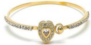
GOLD LAYERED 07.97.0047 INDIVIDUAL BANGLE, HEART DESIGN, WITH MICRO PAVE, GOLD TONE