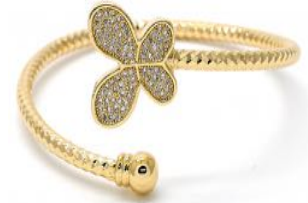
GOLD LAYERED 07.192.0002 INDIVIDUAL BANGLE, BUTTERFLY AND BALL DESIGN, WITH WHITE MICRO PAVE, DIAMOND CUTTING FINISH, GOLD TONE (3 MM THICKNESS, ONE SIZE FITS ALL)