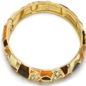
GOLD LAYERED 07.240.0005.05 INDIVIDUAL BANGLE, WITH WHITE CRYSTAL, MULTICOLOR ENAMEL FINISH, GOLD TONE (10 MM THICKNESS, SIZE 5 - 2.50 INCHES DIAMETER)