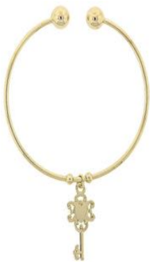
GOLD LAYERED 07.63.0135 INDIVIDUAL BANGLE, GREEK KEY DESIGN, GOLD TONE