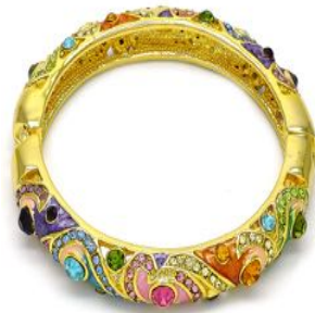
GOLD LAYERED 07.240.0006.04 INDIVIDUAL BANGLE, WITH MULTICOLOR AND MULTICOLOR CRYSTAL AND MULTICOLOR MICRO PAVE, MULTICOLOR ENAMEL FINISH, GOLD TONE (10 MM THICKNESS, SIZE 4 - 2.25