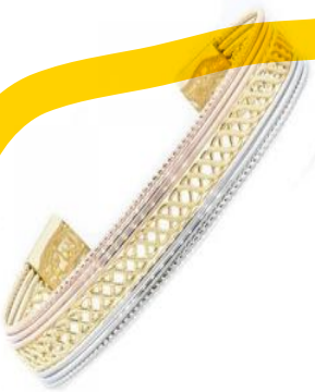
GOLD LAYERED 5.232.010 INDIVIDUAL BANGLE, DIAMOND CUTTING FINISH, GOLD LAYERED 5.232.011 INDIVIDUAL BANGLE, DIAMOND CUTTING FINISH, GOLD LAYERED 5.232.012 INDIVIDUAL BANGLE, TRI TONE TRI TONE