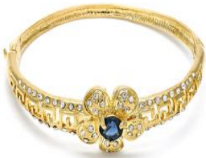
GOLD LAYERED 07.59.0058.05 INDIVIDUAL BANGLE, FLOWER AND GREEK KEY DESIGN, WITH SAPPHIRE BLUE AND WHITE CUBIC ZIRCONIA AND WHITE CRYSTAL, POLISHED FINISH, GOLD TONE (60 MM THICKNESS)