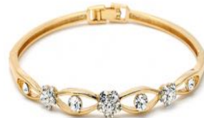
GOLD LAYERED 07.171.0030 INDIVIDUAL BANGLE, FLOWER DESIGN, WITH WHITE CRYSTAL, POLISHED FINISH, GOLD TONE (60 MM THICKNESS, SIZE 5 - 2.50 INCHES DIAMETER)