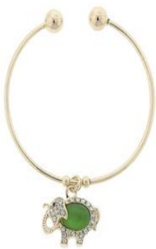
GOLD LAYERED 07.63.0110 INDIVIDUAL BANGLE, ELEPHANT AND BALL DESIGN, WITH LIGHT GREEN AND WHITE OPAL AND WHITE CRYSTAL, POLISHED FINISH, GOLD TONE (2 MM THICKNESS, ONE SIZE FITS AL