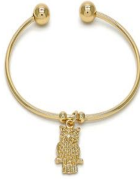
GOLD LAYERED 07.63.0141 INDIVIDUAL BANGLE, OWL DESIGN, POLISHED FINISH, GOLD TONE (2 MM THICKNESS, ONE SIZE FITS ALL)