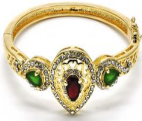
GOLD LAYERED 07.91.0048.1.03 INDIVIDUAL BANGLE, TEARDROP DESIGN, WITH MULTICOLOR CUBIC ZIRCONIA, POLISHED FINISH, GOLD TONE (55 MM RHODIUM TONE (2 MM THICKNESS, SIZE 3)