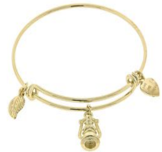
GOLD LAYERED 07.63.0127 INDIVIDUAL BANGLE DESIGN, GOLD TONE