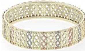
GOLD LAYERED 07.54.0002.05 INDIVIDUAL BANGLE, TRI TONE (SIZE 5 - 2.50 INCHES DIAMETER)