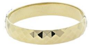
GOLD LAYERED 07.63.0019 INDIVIDUAL BANGLE, DIAMOND CUTTING FINISH, GOLD TONE