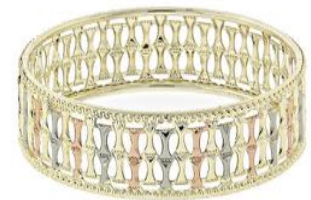
GOLD LAYERED 07.54.0001.05 INDIVIDUAL BANGLE, TRI TONE (SIZE 5 - 2.50 INCHES DIAMETER)