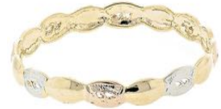
GOLD LAYERED 5.231.006 INDIVIDUAL BANGLE, DIAMOND CUTTING FINISH, TRI TONE