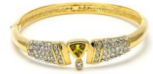
GOLD LAYERED 07.59.0044 INDIVIDUAL BANGLE, WITH DARK APPLE GREEN AND WHITE CRYSTAL, POLISHED FINISH, GOLD TONE (11 MM THICKNESS, SIZE 5 - 2.50 INCHES DIAMETER)