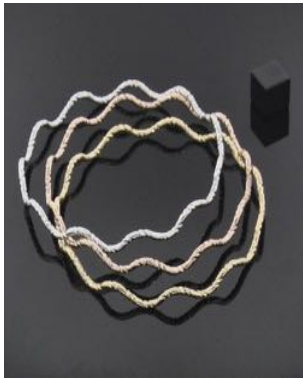
GOLD LAYERED 5.231.001.06 TRIO BANGLE, DIAMOND CUTTING FINISH, TRI GOLD LAYERED 5.231.002.06 TRIO BANGLE, DIAMOND CUTTING FINISH, TRI TONE (SIZE 6 - 2.75 INCHES DIAMETER)