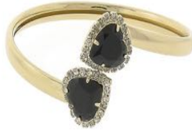
GOLD LAYERED 5.231.012 INDIVIDUAL BANGLE, HEART DESIGN, WITH CUBIC ZIRCONIA, GOLD TONE