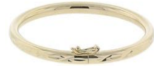
GOLD LAYERED 5.231.016.1 INDIVIDUAL BANGLE, DIAMOND CUTTING FINISH, GOLD TONE (4 MM THICKNESS, SIZE 3 - 2.00 INCHES DIAMETER)