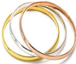
GOLD LAYERED 07.165.0005.1 TRIO BANGLE, POLISHED FINISH, TRI TONE (6 MM THICKNESS, SIZE 5 - 2.50 INCHES DIAMETER)