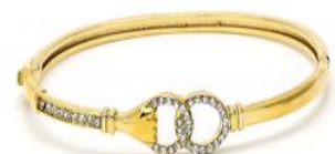
GOLD LAYERED 07.100.0004 INDIVIDUAL BANGLE, WITH WHITE CRYSTAL, POLISHED FINISH, GOLD TONE (3 MM THICKNESS, SIZE 4 - 2.25 INCHES DIAMETER)