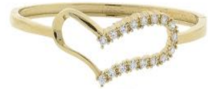
GOLD LAYERED 5.230.003 INDIVIDUAL BANGLE, HEART DESIGN, WITH CUBIC ZIRCONIA, GOLD TONE