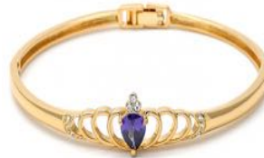
GOLD LAYERED 07.171.0018.5 INDIVIDUAL BANGLE, TEARDROP DESIGN, WITH DARK AMETHYST AND WHITE CUBIC ZIRCONIA AND WHITE CRYSTAL, POLISHED FINISH, GOLD TONE (3 MM THICKNESS, SIZE 5 - 2