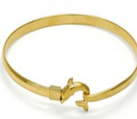
GOLD LAYERED 07.192.0013.06 INDIVIDUAL BANGLE, DOLPHIN DESIGN, POLISHED FINISH, GOLD TONE (13 MM THICKNESS, SIZE 6 - 2.75 INCHES DIAMETER)