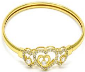
GOLD LAYERED 07.59.0014.05 INDIVIDUAL BANGLE, HEART DESIGN, WITH WHITE CUBIC ZIRCONIA, POLISHED FINISH, GOLD TONE (60 MM THICKNESS, GOLD TONE SIZE 5 - 2.50 INCHES DIAMETER)