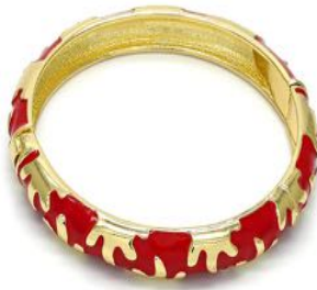
GOLD LAYERED 07.240.0002.05 INDIVIDUAL BANGLE, RED ENAMEL FINISH, GOLD TONE (10 MM THICKNESS, SIZE 5 - 2.50 INCHES DIAMETER)