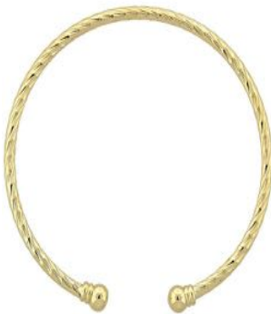
GOLD LAYERED 07.156.0040 INDIVIDUAL BANGLE, GOLD TONE