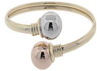
GOLD LAYERED 5.230.013 INDIVIDUAL BANGLE, BALL DESIGN, TRI TONE