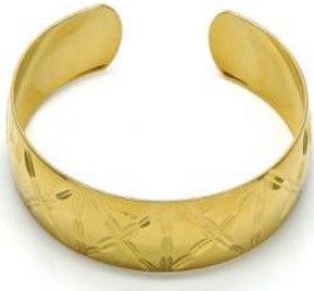
GOLD LAYERED 07.156.0051 INDIVIDUAL BANGLE, DIAMOND CUTTING FINISH, GOLD TONE (15 MM THICKNESS, ONE SIZE FITS ALL)