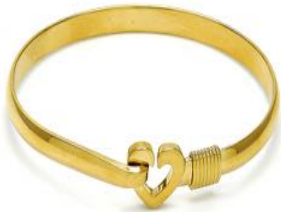
GOLD LAYERED 07.192.0018.03 INDIVIDUAL BANGLE, HEART DESIGN, POLISHED FINISH, GOLD TONE (11 MM THICKNESS, SIZE 3 - 2.00 INCHES DIAMETER)