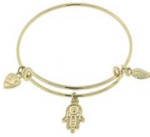
GOLD LAYERED 07.63.0120 INDIVIDUAL BANGLE, HAND OF GOD AND LEAF DESIGN, POLISHED FINISH, GOLD TONE (ONE SIZE FITS ALL)