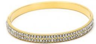
GOLD LAYERED 07.161.0006 INDIVIDUAL BANGLE, WITH WHITE CRYSTAL, POLISHED FINISH, GOLD TONE (ONE SIZE FITS ALL)