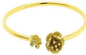
GOLD LAYERED 07.192.0004 INDIVIDUAL BANGLE, FLOWER DESIGN, POLISHED FINISH, GOLD TONE (60 MM THICKNESS, ONE SIZE FITS ALL)