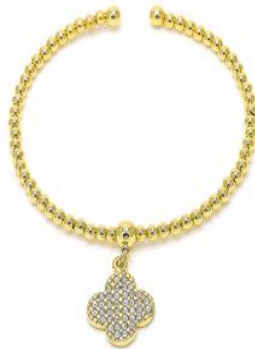
GOLD LAYERED 07.91.0041 INDIVIDUAL BANGLE, FLOWER DESIGN, WITH WHITE CRYSTAL, POLISHED FINISH, GOLD TONE