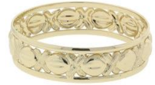
GOLD LAYERED 07.91.0005 INDIVIDUAL BANGLE, DIAMOND CUTTING FINISH, GOLD TONE