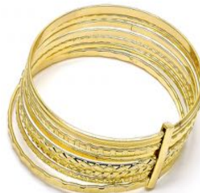
GOLD LAYERED 07.59.0062.06 SEMANARIO BANGLE, DIAMOND CUTTING FINISH, GOLD TONE (22 MM THICKNESS, SIZE 6 - 2.75 INCHES DIAMETER)