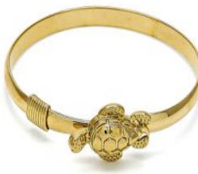
GOLD LAYERED 07.192.0015.03 INDIVIDUAL BANGLE, TURTLE DESIGN, POLISHED FINISH, GOLD TONE (14 MM THICKNESS, SIZE 3 - 2.00 INCHES DIAMETER)