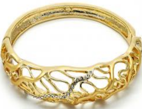
GOLD LAYERED 07.91.0040.05 INDIVIDUAL BANGLE, WITH WHITE CRYSTAL, POLISHED FINISH, GOLD TONE (60 MM THICKNESS, SIZE 5 - 2.50 INCHES DIAMETER)