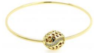
GOLD LAYERED 07.195.0001 INDIVIDUAL BANGLE, WITH WHITE MICRO PAVE, POLISHED FINISH, GOLD TONE (60 MM THICKNESS, ONE SIZE FITS ALL)