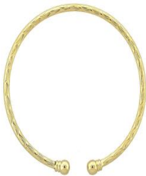
GOLD LAYERED 07.156.0043 INDIVIDUAL BANGLE, GOLD TONE