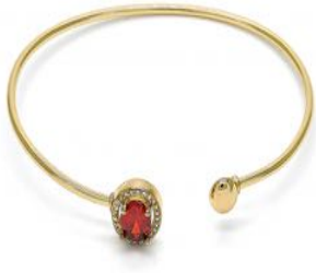
GOLD LAYERED 07.156.0048 INDIVIDUAL BANGLE, WITH GARNET AND WHITE CUBIC ZIRCONIA AND WHITE CRYSTAL, POLISHED FINISH, GOLD TONE (2 MM THICKNESS, ONE SIZE FITS ALL)