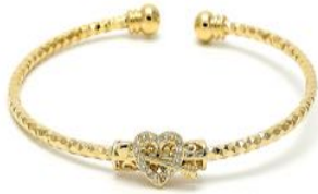
GOLD LAYERED 07.63.0178 INDIVIDUAL BANGLE, HEART DESIGN, WITH WHITE MICRO PAVE, DIAMOND CUTTING FINISH, GOLD TONE (60 MM THICKNESS, ONE SIZE FITS ALL)