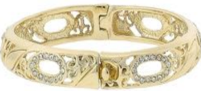
GOLD LAYERED 07.91.0014 INDIVIDUAL BANGLE, WITH CUBIC ZIRCONIA, GOLD TONE