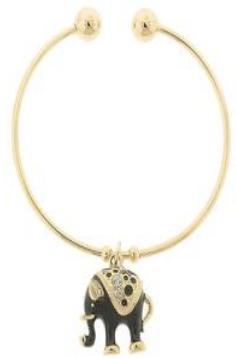
GOLD LAYERED 07.38.0056.7 INDIVIDUAL BANGLE, ELEPHANT DESIGN, ENAMEL FINISH, GOLD TONE