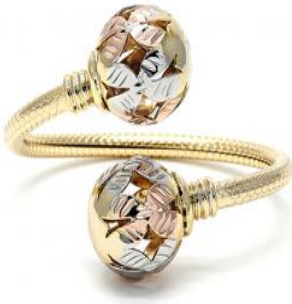
GOLD LAYERED 07.65.0102.1 INDIVIDUAL BANGLE, BOW DESIGN, DIAMOND CUTTING FINISH, TRI TONE (5 MM THICKNESS, SIZE 6 - 2.75 INCHES DIAMETER)