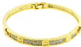
GOLD LAYERED 07.59.0048.05 INDIVIDUAL BANGLE, WITH WHITE CRYSTAL, POLISHED FINISH, GOLD TONE (60 MM THICKNESS, SIZE 5 - 2.50 INCHES DIAMETER)