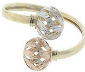
GOLD LAYERED 07.65.0185 INDIVIDUAL BANGLE, BALL DESIGN, DIAMOND CUTTING FINISH, TRI TONE