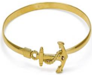
GOLD LAYERED 07.192.0022.06 INDIVIDUAL BANGLE, ANCHOR DESIGN, POLISHED FINISH, GOLD TONE (21 MM THICKNESS, SIZE 6 - 2.75 INCHES DIAMETER)