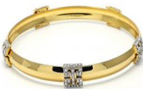
GOLD LAYERED 07.59.0036 INDIVIDUAL BANGLE, WITH CRYSTAL, GOLD TONE