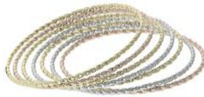
GOLD LAYERED 5.233.015.1 SEMANARIO BANGLE, TWIST DESIGN, DIAMOND CUTTING FINISH, TRI TONE (2 MM THICKNESS, SIZE 6 - 2.75 INCHES DIAMETER)