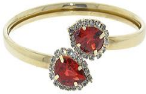
GOLD LAYERED 5.231.011 INDIVIDUAL BANGLE, HEART DESIGN, WITH CUBIC ZIRCONIA, GOLD TONE