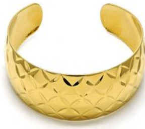
GOLD LAYERED 07.156.0052 INDIVIDUAL BANGLE, DIAMOND CUTTING FINISH, GOLD TONE (20 MM THICKNESS, ONE SIZE FITS ALL)