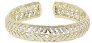
GOLD LAYERED 07.156.0013 INDIVIDUAL BANGLE, DIAMOND CUTTING FINISH, TRI TONE