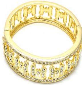
GOLD LAYERED 07.59.0056.04 INDIVIDUAL BANGLE, WITH WHITE CRYSTAL, POLISHED FINISH, GOLD TONE (55 MM THICKNESS, SIZE 4 - 2.25 INCHES DIAMETER)