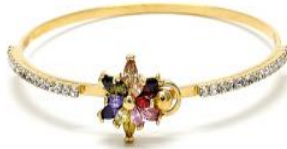
GOLD LAYERED 07.97.0016.1 INDIVIDUAL BANGLE, FLOWER DESIGN, WITH MULTICOLOR CUBIC ZIRCONIA, POLISHED FINISH, GOLD TONE (2 MM THICKNESS, SIZE 3 - 2.00 INCHES DIAMETER)