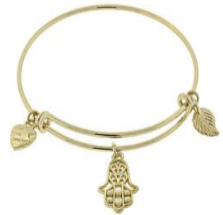
GOLD LAYERED 07.63.0124 INDIVIDUAL BANGLE DESIGN, GOLD TONE