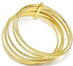
GOLD LAYERED 07.59.0061.06 SEMANARIO BANGLE, DIAMOND CUTTING FINISH, GOLD TONE (22 MM THICKNESS, SIZE 6 - 2.75 INCHES DIAMETER)