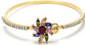
GOLD LAYERED 07.97.0030 INDIVIDUAL BANGLE, FLOWER DESIGN, WITH CUBIC ZIRCONIA, GOLD TONE