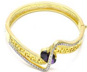
GOLD LAYERED 07.59.0054.05 INDIVIDUAL BANGLE, GREEK KEY DESIGN, WITH AMETHYST AND WHITE CUBIC ZIRCONIA AND WHITE CRYSTAL, POLISHED FINISH, TWO TONE (60 MM THICKNESS, SIZE 5 - 2.50