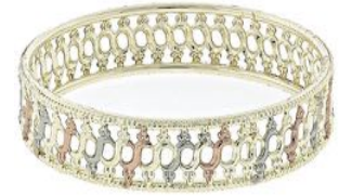
GOLD LAYERED 07.54.0007.05 INDIVIDUAL BANGLE, TRI TONE (SIZE 5 - 2.50 INCHES DIAMETER)