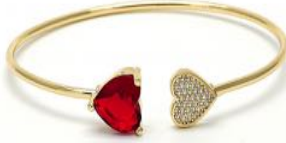
GOLD LAYERED 07.156.0064 INDIVIDUAL BANGLE, HEART DESIGN, WITH GARNET AND WHITE CUBIC ZIRCONIA AND WHITE MICRO PAVE, GOLD TONE FINISH, TRI TONE (2 MM THICKNESS, SIZE 5 - 2.50 INCHES DIAMETER)