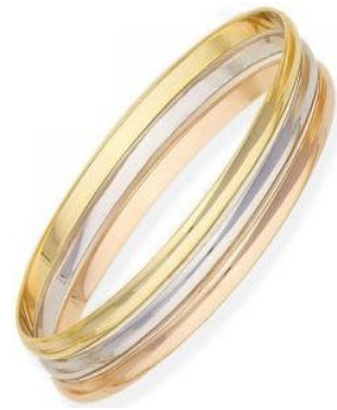
GOLD LAYERED 5.233.010 TRIO BANGLE, POLISHED FINISH, TRI TONE