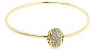
GOLD LAYERED 07.195.0010 INDIVIDUAL BANGLE, BALL DESIGN, WITH WHITE MICRO PAVE, POLISHED FINISH, GOLD TONE (60 MM THICKNESS, ONE SIZE FITS ALL)