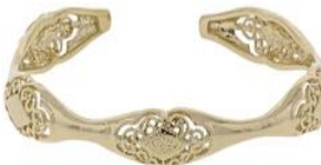
GOLD LAYERED 07.156.0018 INDIVIDUAL BANGLE, DIAMOND CUTTING FINISH, GOLD TONE (9 MM THICKNESS, ONE SIZE FITS ALL)