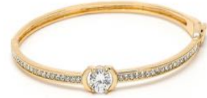
GOLD LAYERED 07.171.0025.4 INDIVIDUAL BANGLE, WITH WHITE AND WHITE CUBIC ZIRCONIA, POLISHED FINISH, GOLD TONE (7 MM THICKNESS, SIZE 4 - 2.25 INCHES DIAMETER)