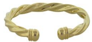
GOLD LAYERED 5.230.016.1 INDIVIDUAL BANGLE, GOLD TONE