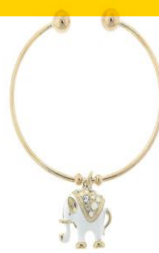
GOLD LAYERED 07.38.0056.3 INDIVIDUAL BANGLE, ELEPHANT DESIGN, GOLD TONE