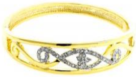
GOLD LAYERED 07.59.0009 INDIVIDUAL BANGLE, FLOWER DESIGN, WITH WHITE CRYSTAL, POLISHED FINISH, TWO TONE (60 MM THICKNESS, SIZE 4 - TONE 2.25 INCHES DIAMETER)