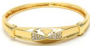
GOLD LAYERED 07.59.0032 INDIVIDUAL BANGLE, WITH CUBIC ZIRCONIA, GOLD TONE