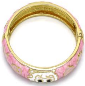
GOLD LAYERED 07.240.0007.1.03 INDIVIDUAL BANGLE, PINK ENAMEL FINISH, GOLD TONE (10 MM THICKNESS, SIZE 3 - 2.00 INCHES DIAMETER)