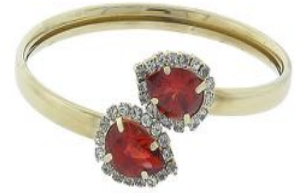
GOLD LAYERED 5.231.014 INDIVIDUAL BANGLE, WITH CUBIC ZIRCONIA, GOLD TONE