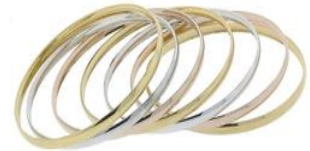
GOLD LAYERED 5.232.005.06 SEMANARIO BANGLE, TRI TONE (SIZE 6 - 2.75 INCHES DIAMETER)