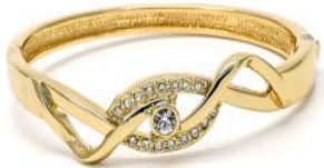
GOLD LAYERED 07.59.0042 INDIVIDUAL BANGLE, WITH CRYSTAL, GOLD TONE