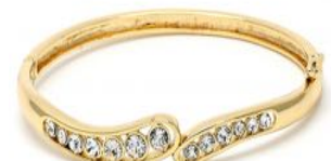
GOLD LAYERED 07.91.0042 INDIVIDUAL BANGLE, WITH WHITE CRYSTAL, POLISHED FINISH, GOLD TONE (ONE SIZE FITS ALL)