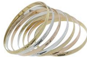
GOLD LAYERED 116.010.05 SEMANARIO BANGLE, DIAMOND CUTTING FINISH, TRI TONE (SIZE 5 - 2.50 INCHES DIAMETER)