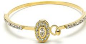
GOLD LAYERED 07.97.0036 INDIVIDUAL BANGLE, WITH WHITE AND WHITE MICRO PAVE AND WHITE CUBIC ZIRCONIA, POLISHED FINISH, GOLD TONE (2 MM THICKNESS, SIZE 3 - 2.00 INCHES DIAMETER)