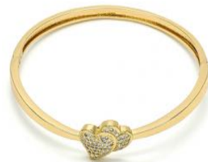
GOLD LAYERED 07.156.0008.05 INDIVIDUAL BANGLE, HEART DESIGN, WITH WHITE MICRO PAVE, GOLD TONE (60 MM THICKNESS, SIZE 5 - 2.50 INCHES DIAMETER)