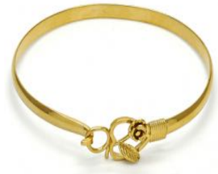
GOLD LAYERED 07.192.0017.06 INDIVIDUAL BANGLE, FLOWER AND HEART DESIGN, POLISHED FINISH, GOLD TONE (13 MM THICKNESS, SIZE 6 - 2.75 INCHES DIAMETER)