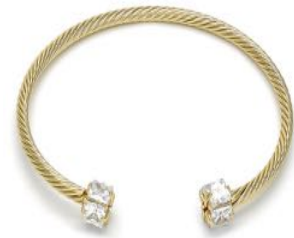
GOLD LAYERED 07.97.0015 INDIVIDUAL BANGLE, TWIST DESIGN, WITH WHITE CUBIC ZIRCONIA, POLISHED FINISH, GOLD TONE (3 MM THICKNESS, ONE SIZE FITS ALL)