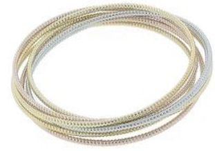
GOLD LAYERED 5.233.006 SEMANARIO BANGLE, DIAMOND CUTTING FINISH, TRI TONE