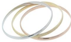
GOLD LAYERED 5.233.005.06 TRIO BANGLE, DIAMOND CUTTING FINISH, TRI TONE (SIZE 6 - 2.75 INCHES DIAMETER)