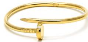
GOLD LAYERED 07.192.0001 INDIVIDUAL BANGLE, NAIL DESIGN, POLISHED FINISH, GOLD TONE (ONE SIZE FITS ALL)