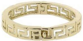
GOLD LAYERED 07.91.0006 INDIVIDUAL BANGLE, GREEK KEY DESIGN, POLISHED FINISH, GOLD TONE (8 MM THICKNESS, SIZE 2 - 1.75 INCHES DIAMETER)