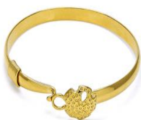
GOLD LAYERED 07.192.0014.03 INDIVIDUAL BANGLE, FLOWER DESIGN, POLISHED FINISH, GOLD TONE (12 MM THICKNESS, SIZE 3 - 2.00 INCHES DIAMETER)