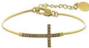
GOLD LAYERED 07.165.0003.1 INDIVIDUAL BANGLE, CROSS DESIGN, WITH MULTICOLOR CUBIC ZIRCONIA, POLISHED FINISH, GOLD TONE (1 MM THICKNESS, SIZE 5 - 2.50 INCHES DIAMETER)