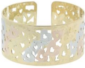
GOLD LAYERED 5.232.007 INDIVIDUAL BANGLE, HEART DESIGN, DIAMOND CUTTING FINISH, TRI TONE