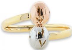
GOLD LAYERED 07.65.0120 INDIVIDUAL BANGLE, BALL DESIGN, TRI TONE