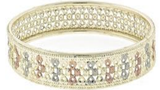
GOLD LAYERED 07.54.0005.06 INDIVIDUAL BANGLE, TRI TONE (SIZE 6 - 2.75 INCHES DIAMETER)