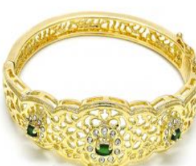
GOLD LAYERED 07.91.0047.04 INDIVIDUAL BANGLE, WITH EMERALD AND WHITE CUBIC ZIRCONIA AND WHITE CRYSTAL, POLISHED FINISH, GOLD TONE (55 MM THICKNESS, SIZE 4 - 2.25 INCHES DIAMETER)