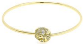
GOLD LAYERED 07.195.0008 INDIVIDUAL BANGLE, WITH WHITE AND WHITE MICRO PAVE AND WHITE CUBIC ZIRCONIA, POLISHED FINISH, GOLD TONE (60 MM THICKNESS, ONE SIZE FITS ALL)