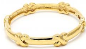
GOLD LAYERED 07.168.0003 INDIVIDUAL BANGLE, LOVE KNOT DESIGN, WITH CRYSTAL, POLISHED FINISH, GOLD TONE (ONE SIZE FITS ALL)