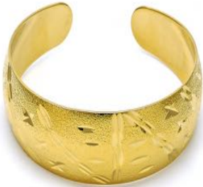
GOLD LAYERED 07.156.0060.1 INDIVIDUAL BANGLE, DIAMOND CUTTING FINISH, GOLD TONE (20 MM THICKNESS, ONE SIZE FITS ALL)