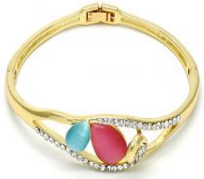
GOLD LAYERED 07.65.0217.1.05 INDIVIDUAL BANGLE, TEARDROP DESIGN, WITH MULTICOLOR AND WHITE OPAL AND WHITE CRYSTAL, POLISHED FINISH, GOLD TONE (16 MM THICKNESS, SIZE 5 - 2.50 INCHES DIAMETER)