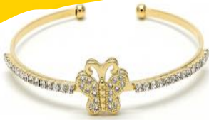
GOLD LAYERED 07.97.0054 INDIVIDUAL BANGLE, WITH CUBIC ZIRCONIA, GOLD TONE