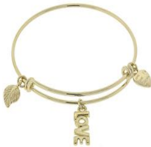
GOLD LAYERED 07.63.0131 INDIVIDUAL BANGLE, LOVE AND LEAF DESIGN, POLISHED FINISH, GOLD TONE (ONE SIZE FITS ALL)