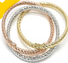
GOLD LAYERED 5.232.001.04 TRIO BANGLE, DIAMOND CUTTING FINISH, TRI TONE (SIZE 4 - 2.25 INCHES DIAMETER)