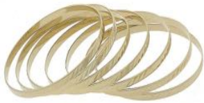
GOLD LAYERED 116.006.06 SEMANARIO BANGLE, GOLD TONE (SIZE 6 - 2.75 INCHES DIAMETER)