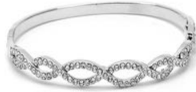
GOLD LAYERED 07.100.0001.1 INDIVIDUAL BANGLE, WITH WHITE CRYSTAL, POLISHED FINISH, RHODIUM TONE (4 MM THICKNESS, ONE SIZE FITS ALL)