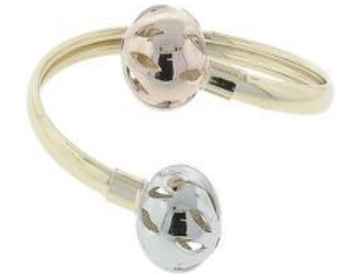
GOLD LAYERED 07.65.0121 INDIVIDUAL BANGLE, BALL DESIGN, TRI TONE