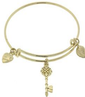
GOLD LAYERED 07.63.0132 INDIVIDUAL BANGLE, KEY AND LEAF DESIGN, POLISHED FINISH, GOLD TONE (2 MM THICKNESS, SIZE 4 - 2.25 INCHES DIAMETER)