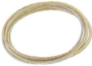
GOLD LAYERED 5.233.007 SEMANARIO BANGLE, DIAMOND CUTTING FINISH, TRI TONE