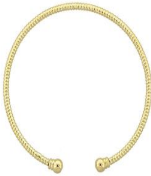
GOLD LAYERED 07.156.0041 INDIVIDUAL BANGLE, GOLD TONE