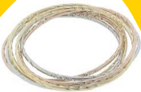
GOLD LAYERED 07.65.0165 SEMANARIO BANGLE, DIAMOND CUTTING FINISH, TRI TONE (SIZE 4 - 2.25 INCHES DIAMETER)