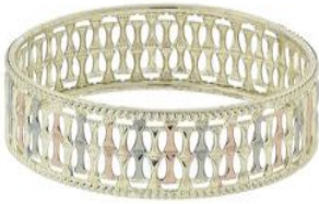
GOLD LAYERED 07.54.0006.05 INDIVIDUAL BANGLE, TRI TONE (SIZE 5 - 2.50 INCHES DIAMETER)