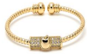
GOLD LAYERED 07.193.0010.1 INDIVIDUAL BANGLE, APPLE AND BALL DESIGN, WITH WHITE MICRO PAVE, DIAMOND CUTTING FINISH, GOLD TONE (2 MM THICKNESS, ONE SIZE FITS ALL)