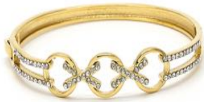
GOLD LAYERED 07.100.0005 INDIVIDUAL BANGLE, BOW DESIGN, WITH WHITE CRYSTAL, POLISHED FINISH, GOLD TONE (5 MM THICKNESS, ONE SIZE FITS ALL)