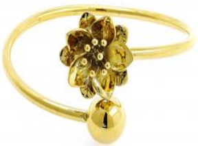
GOLD LAYERED 07.192.0006 INDIVIDUAL BANGLE, FLOWER AND BALL DESIGN, POLISHED FINISH, GOLD TONE (35 MM THICKNESS, ONE SIZE FITS ALL)