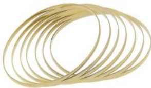
GOLD LAYERED 5.232.002.05 SEMANARIO BANGLE, GOLD TONE (SIZE 5 - 2.50 INCHES DIAMETER)