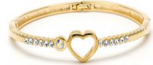
GOLD LAYERED 07.171.0020.1 INDIVIDUAL BANGLE, HEART DESIGN, WITH MULTICOLOR AND WHITE CRYSTAL, POLISHED FINISH, GOLD TONE (5 MM THICKNESS, SIZE 5 - 2.50 INCHES DIAMETER)