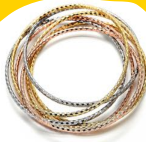
GOLD LAYERED 5.233.012 SEMANARIO BANGLE, DIAMOND CUTTING FINISH, TRI TONE