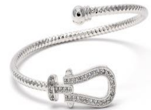
GOLD LAYERED 07.192.0003.1 INDIVIDUAL BANGLE, BELT BUCKLE DESIGN, WITH WHITE CUBIC ZIRCONIA, DIAMOND CUTTING FINISH, RHODIUM TONE (3 MM THICKNESS, SIZE 3 - 2.00 INCHES DIAMETER)