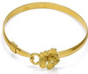
GOLD LAYERED 07.192.0021.06 INDIVIDUAL BANGLE, FLOWER DESIGN, POLISHED FINISH, GOLD TONE (17 MM THICKNESS, SIZE 6 - 2.75 INCHES DIAMETER)