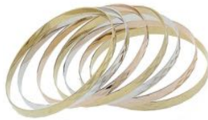
GOLD LAYERED 116.008.05 SEMANARIO BANGLE, TRI TONE (SIZE 5 - 2.50 INCHES DIAMETER)