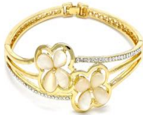
GOLD LAYERED 07.65.0211.05 INDIVIDUAL BANGLE, FLOWER DESIGN, WITH IVORY AND WHITE OPAL AND WHITE CRYSTAL, POLISHED FINISH, GOLD TONE (30 MM THICKNESS, SIZE 5 - 2.50 INCHES DIAMETER