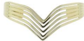
GOLD LAYERED 5.229.003 INDIVIDUAL BANGLE, POLISHED FINISH, GOLD TONE (15 MM THICKNESS, SIZE 6 - 2.75 INCHES DIAMETER)