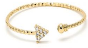
GOLD LAYERED 07.193.0014 INDIVIDUAL BANGLE, BALL DESIGN, WITH WHITE CUBIC ZIRCONIA, DIAMOND CUTTING FINISH, GOLD TONE (3 MM THICKNESS, ONE SIZE FITS ALL)