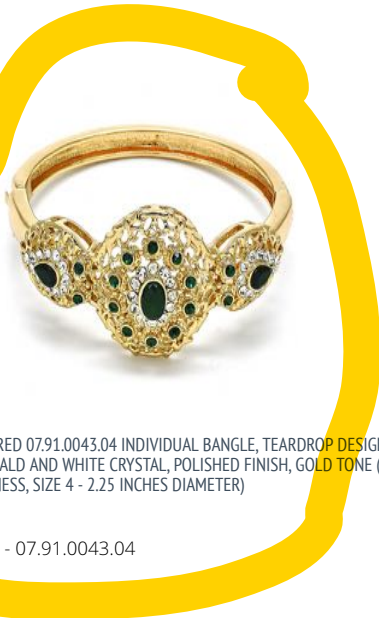
GOLD LAYERED 07.91.0043.04 INDIVIDUAL BANGLE, TEARDROP DESIGN, WITH EMERALD AND WHITE CRYSTAL, POLISHED FINISH, GOLD TONE (55 MM THICKNESS, SIZE 4 - 2.25 INCHES DIAMETER)