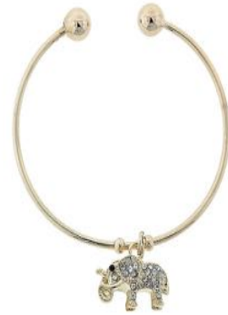
GOLD LAYERED 07.63.0109 INDIVIDUAL BANGLE, ELEPHANT DESIGN, WITH WHITE AND BLACK CUBIC ZIRCONIA, GOLD TONE