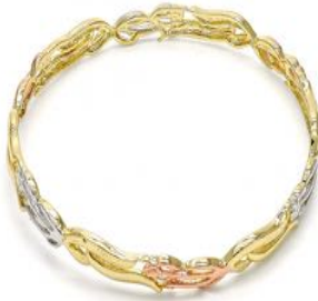
GOLD LAYERED 5.231.005.05 INDIVIDUAL BANGLE, FLOWER DESIGN, DIAMOND CUTTING FINISH, TRI TONE (8 MM THICKNESS, SIZE 5 - 2.50 INCHES DIAMETER)