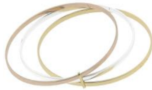
GOLD LAYERED 07.63.0162.06 TRIO BANGLE, TRI TONE (SIZE 6 - 2.75 INCHES DIAMETER)