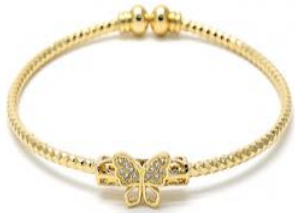
GOLD LAYERED 07.63.0175 INDIVIDUAL BANGLE, WITH MICRO PAVE, GOLD TONE