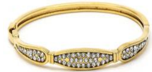
GOLD LAYERED 07.100.0002 INDIVIDUAL BANGLE, WITH WHITE CRYSTAL, POLISHED FINISH, GOLD TONE (5 MM THICKNESS, SIZE 4 - 2.25 INCHES DIAMETER)