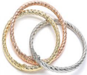
GOLD LAYERED 5.232.001.03 TRIO BANGLE, DIAMOND CUTTING FINISH, TRI TONE (SIZE 3 - 2.00 INCHES DIAMETER)