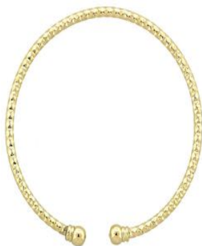
GOLD LAYERED 07.156.0044 INDIVIDUAL BANGLE, GOLD TONE