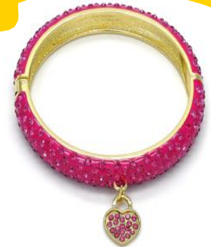
GOLD LAYERED 07.240.0004.2.05 INDIVIDUAL BANGLE, HEART DESIGN, WITH RUBY CRYSTAL, PINK ENAMEL FINISH, GOLD TONE (10 MM THICKNESS, SIZE 5 - 2.50 INCHES DIAMETER)