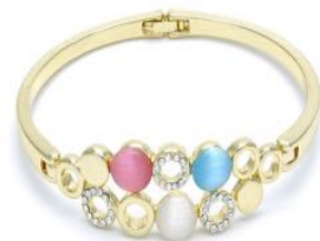
GOLD LAYERED 07.65.0212.1.04 INDIVIDUAL BANGLE, WITH MULTICOLOR AND WHITE OPAL AND WHITE CRYSTAL, POLISHED FINISH, GOLD TONE (16 MM THICKNESS, SIZE 4 - 2.25 INCHES DIAMETER)