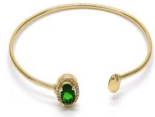
GOLD LAYERED 07.156.0048.2 INDIVIDUAL BANGLE, WITH EMERALD AND WHITE CUBIC ZIRCONIA AND WHITE CRYSTAL, POLISHED FINISH, GOLD TONE (2 MM THICKNESS, ONE SIZE FITS ALL)