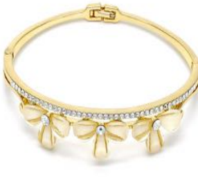
GOLD LAYERED 07.65.0216.05 INDIVIDUAL BANGLE, FLOWER DESIGN, WITH IVORY AND WHITE OPAL AND WHITE CRYSTAL, POLISHED FINISH, GOLD TONE (13 MM THICKNESS, SIZE 5 - 2.50 INCHES DIAMETER)