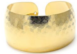
GOLD LAYERED 07.165.0008 INDIVIDUAL BANGLE, GOLD TONE (ONE SIZE FITS ALL)