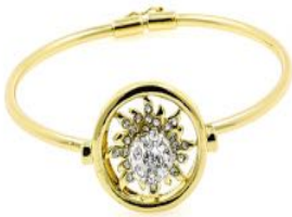
GOLD LAYERED 07.59.0047 INDIVIDUAL BANGLE, SUN AND BALL DESIGN, WITH WHITE CRYSTAL, POLISHED FINISH, GOLD TONE (60 MM THICKNESS, SIZE 3 - 2.00 INCHES DIAMETER)