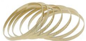
GOLD LAYERED 116.006.05 SEMANARIO BANGLE, GOLD TONE (SIZE 5 - 2.50 INCHES DIAMETER)