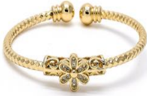
GOLD LAYERED 07.193.0002.1 INDIVIDUAL BANGLE, FLOWER AND HEART DESIGN, WITH WHITE MICRO PAVE, DIAMOND CUTTING FINISH, GOLD TONE (ONE SIZE FITS ALL)