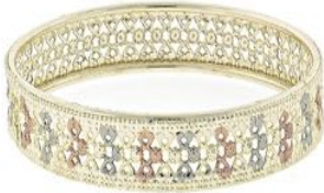
GOLD LAYERED 07.54.0005.05 INDIVIDUAL BANGLE, TRI TONE (SIZE 5 - 2.50 INCHES DIAMETER)