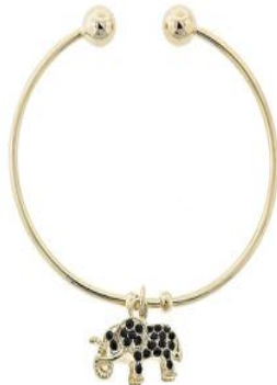
GOLD LAYERED 07.63.0108 INDIVIDUAL BANGLE, ELEPHANT DESIGN, WITH BLACK CRYSTAL, GOLD TONE