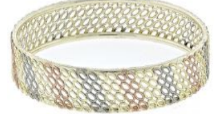
GOLD LAYERED 07.54.0004.05 INDIVIDUAL BANGLE, TRI TONE (SIZE 5 - 2.50 INCHES DIAMETER)