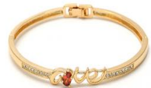
GOLD LAYERED 07.171.0019 INDIVIDUAL BANGLE, LOVE DESIGN, WITH ORANGE RED AND WHITE CUBIC ZIRCONIA AND WHITE CRYSTAL, POLISHED FINISH, GOLD TONE (3 MM THICKNESS, SIZE 5 - 2.50 INCHES