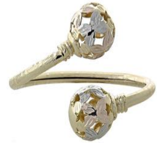
GOLD LAYERED 07.65.0102 INDIVIDUAL BANGLE, BUTTERFLY AND STAR DESIGN, DIAMOND CUTTING FINISH, TRI TONE (5 MM THICKNESS, SIZE 6 - 2.75 INCHES DIAMETER)