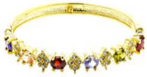
GOLD LAYERED 07.59.0027 INDIVIDUAL BANGLE, WITH MULTICOLOR AND WHITE CUBIC ZIRCONIA AND WHITE CRYSTAL, POLISHED FINISH, GOLD TONE (60 MM THICKNESS, SIZE 4 - 2.25 INCHES DIAMETER)