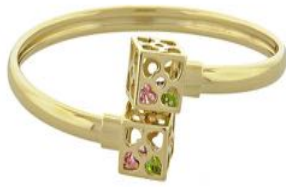
GOLD LAYERED 5.230.009 INDIVIDUAL BANGLE, WITH CRYSTAL, GOLD TONE