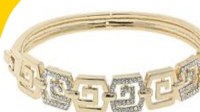
GOLD LAYERED 07.38.0050 INDIVIDUAL BANGLE, GREEK KEY DESIGN, WITH WHITE CRYSTAL, POLISHED FINISH, GOLD TONE (SIZE 5 - 2.50 INCHES DIAMETER)