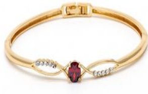
GOLD LAYERED 07.171.0027.1 INDIVIDUAL BANGLE, WITH GARNET AND WHITE CUBIC ZIRCONIA AND WHITE CRYSTAL, POLISHED FINISH, GOLD TONE (3 MM THICKNESS, SIZE 5 - 2.50 INCHES DIAMETER)