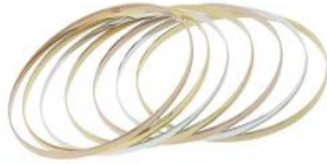
GOLD LAYERED 5.232.003.05 SEMANARIO BANGLE, POLISHED FINISH, TRI TONE (SIZE 5 - 2.50 INCHES DIAMETER)