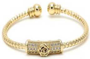
GOLD LAYERED 07.193.0009.1 INDIVIDUAL BANGLE, FLOWER AND BALL DESIGN, WITH WHITE MICRO PAVE, DIAMOND CUTTING FINISH, GOLD TONE (3 MM THICKNESS, ONE SIZE FITS ALL)