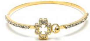
GOLD LAYERED 07.97.0037 INDIVIDUAL BANGLE, WITH WHITE AND WHITE MICRO PAVE AND WHITE CUBIC ZIRCONIA, POLISHED FINISH, GOLD TONE (2 MM THICKNESS, SIZE 3 - 2.00 INCHES DIAMETER)