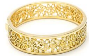
GOLD LAYERED 07.59.0016 INDIVIDUAL BANGLE DESIGN, GOLD TONE