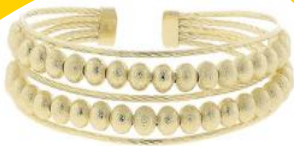
GOLD LAYERED 5.229.001 INDIVIDUAL BANGLE, BALL DESIGN, DIAMOND CUTTING FINISH, GOLD TONE