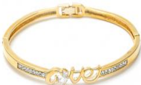
GOLD LAYERED 07.171.0019.1 INDIVIDUAL BANGLE, LOVE DESIGN, WITH WHITE AND WHITE CUBIC ZIRCONIA AND WHITE CRYSTAL, POLISHED FINISH, GOLD TONE (3 MM THICKNESS, SIZE 4 - 2.25 INCHES D