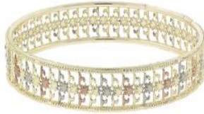
GOLD LAYERED 07.54.0006.06 INDIVIDUAL BANGLE, TRI TONE (SIZE 6 - 2.75 INCHES DIAMETER)