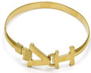
GOLD LAYERED 07.192.0011.06 INDIVIDUAL BANGLE, ANCHOR DESIGN, POLISHED FINISH, GOLD TONE (16 MM THICKNESS, SIZE 6 - 2.75 INCHES DIAMETER)