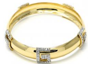
GOLD LAYERED 07.59.0035 INDIVIDUAL BANGLE, GREEK KEY DESIGN, WITH WHITE CRYSTAL, GOLD TONE