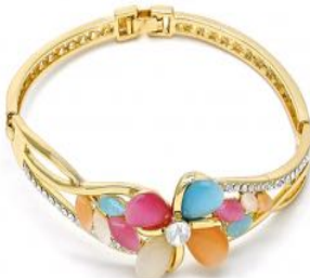
GOLD LAYERED 07.65.0218.05 INDIVIDUAL BANGLE, FLOWER AND LEAF DESIGN, WITH MULTICOLOR AND WHITE OPAL AND WHITE CRYSTAL, POLISHED FINISH, GOLD TONE (20 MM THICKNESS, SIZE 5 - 2.50 I