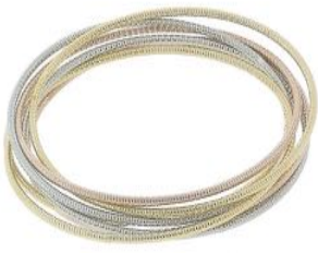
GOLD LAYERED 5.233.015 SEMANARIO BANGLE, DIAMOND CUTTING FINISH, GOLD LAYERED 5.233.015.1 SEMANARIO BANGLE, TWIST DESIGN, DIAMOND TRI TONE (2 MM THICKNESS, SIZE 5 - 2.50 INCHES DIAMETER)