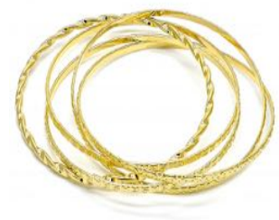
GOLD LAYERED 07.59.0063.06 SET BANGLE, TWIST DESIGN, DIAMOND CUTTING FINISH, GOLD TONE (13 MM THICKNESS, SIZE 6 - 2.75 INCHES DIAMETER)