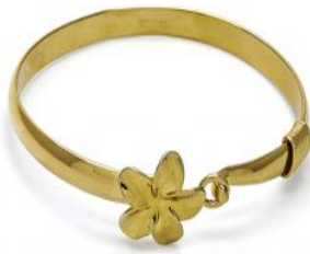
GOLD LAYERED 07.192.0026.03 INDIVIDUAL BANGLE, FLOWER DESIGN, POLISHED FINISH, GOLD TONE (15 MM THICKNESS, SIZE 3 - 2.00 INCHES DIAMETER)