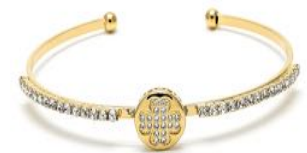
GOLD LAYERED 07.97.0050 INDIVIDUAL BANGLE, WITH CUBIC ZIRCONIA, GOLD TONE