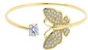
GOLD LAYERED 07.199.0001 INDIVIDUAL BANGLE, BUTTERFLY DESIGN, WITH WHITE AND WHITE MICRO PAVE AND WHITE CUBIC ZIRCONIA, POLISHED FINISH, GOLD TONE (50 MM THICKNESS, ONE SIZE FITS A