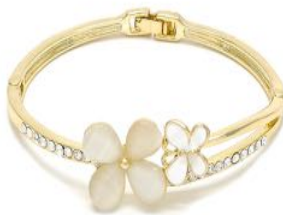
GOLD LAYERED 07.65.0207.05 INDIVIDUAL BANGLE, BUTTERFLY AND FLOWER DESIGN, WITH IVORY AND WHITE OPAL AND WHITE CRYSTAL, WHITE ENAMEL FINISH, GOLD TONE (17 MM THICKNESS, SIZE 5 - 2)