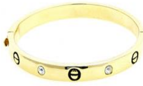
GOLD LAYERED 07.59.0053.05 INDIVIDUAL BANGLE, WITH WHITE CRYSTAL, BLACK POLISHED FINISH, GOLD TONE (60 MM THICKNESS, SIZE 5 - 2.50 INCHES DIAMETER)