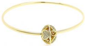
GOLD LAYERED 07.195.0011 INDIVIDUAL BANGLE, BALL DESIGN, WITH WHITE MICRO PAVE, POLISHED FINISH, GOLD TONE (60 MM THICKNESS, ONE SIZE FITS ALL)