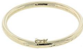
GOLD LAYERED 5.231.018.1 INDIVIDUAL BANGLE, DIAMOND CUTTING FINISH, GOLD TONE (4 MM THICKNESS, SIZE 4 - 2.25 INCHES DIAMETER)