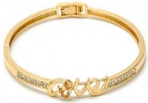
GOLD LAYERED 07.171.0019.4 INDIVIDUAL BANGLE, LOVE DESIGN, WITH DARK CHAMPAGNE AND WHITE CUBIC ZIRCONIA AND WHITE CRYSTAL, POLISHED FINISH, GOLD TONE (3 MM THICKNESS, SIZE 4 - 2.25