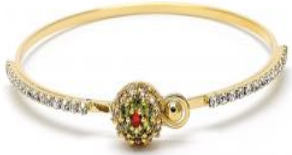
GOLD LAYERED 07.97.0029 INDIVIDUAL BANGLE, FLOWER DESIGN, WITH CUBIC ZIRCONIA, GOLD TONE