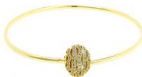
GOLD LAYERED 07.195.0012 INDIVIDUAL BANGLE, BALL DESIGN, WITH WHITE MICRO PAVE, POLISHED FINISH, GOLD TONE (60 MM THICKNESS, ONE SIZE FITS ALL)