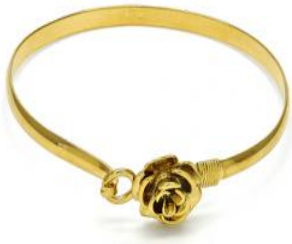
GOLD LAYERED 07.192.0016.06 INDIVIDUAL BANGLE, FLOWER DESIGN, POLISHED FINISH, GOLD TONE (17 MM THICKNESS, SIZE 6 - 2.75 INCHES DIAMETER)