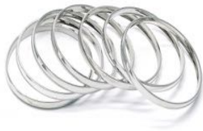
GOLD LAYERED 5.232.004.1.02 SEMANARIO BANGLE, POLISHED FINISH, RHODIUM TONE (SIZE 2 - 1.75 INCHES DIAMETER)