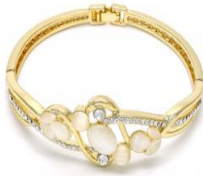
GOLD LAYERED 07.65.0214.05 INDIVIDUAL BANGLE, WITH IVORY AND WHITE OPAL AND WHITE CRYSTAL, POLISHED FINISH, GOLD TONE (21 MM THICKNESS, SIZE 5 - 2.50 INCHES DIAMETER)