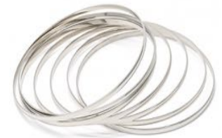
GOLD LAYERED 5.232.002.1.05 SEMANARIO BANGLE, POLISHED FINISH, RHODIUM TONE (2 MM THICKNESS, SIZE 5)