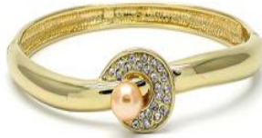
GOLD LAYERED 07.59.0040 INDIVIDUAL BANGLE, WITH PEARL, GOLD TONE