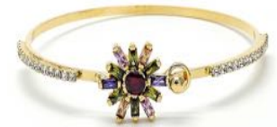
GOLD LAYERED 07.97.0034 INDIVIDUAL BANGLE, FLOWER DESIGN, WITH CUBIC ZIRCONIA, GOLD TONE