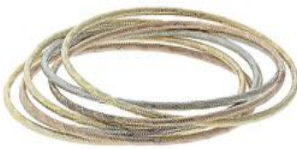
GOLD LAYERED 5.233.011.06 SEMANARIO BANGLE, DIAMOND CUTTING FINISH, TRI TONE (SIZE 6 - 2.75 INCHES DIAMETER)