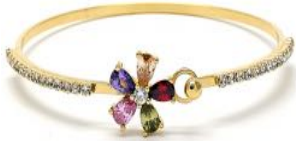
GOLD LAYERED 07.97.0032 INDIVIDUAL BANGLE, FLOWER DESIGN, WITH CUBIC ZIRCONIA, GOLD TONE