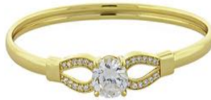
GOLD LAYERED 07.59.0015 INDIVIDUAL BANGLE, WITH CUBIC ZIRCONIA,