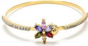
GOLD LAYERED 07.97.0046 INDIVIDUAL BANGLE, FLOWER DESIGN, WITH CUBIC ZIRCONIA, GOLD TONE