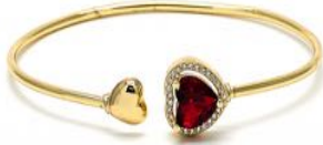
GOLD LAYERED 07.156.0063 INDIVIDUAL BANGLE, HEART DESIGN, WITH GARNET AND WHITE CUBIC ZIRCONIA AND WHITE MICRO PAVE, POLISHED FINISH, GOLD TONE (2 MM THICKNESS, ONE SIZE FITS ALL)