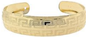
GOLD LAYERED 5.229.005 INDIVIDUAL BANGLE, GREEK KEY DESIGN, DIAMOND CUTTING FINISH, GOLD TONE