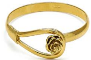
GOLD LAYERED 07.156.0004.03 INDIVIDUAL BANGLE, FLOWER DESIGN, POLISHED FINISH, GOLD TONE (16 MM THICKNESS, SIZE 3 - 2.00 INCHES DIAMETER)