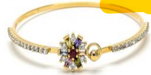
GOLD LAYERED 07.97.0031 INDIVIDUAL BANGLE, FLOWER DESIGN, WITH CUBIC ZIRCONIA, GOLD TONE