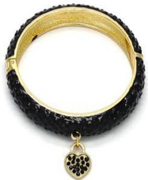
GOLD LAYERED 07.240.0004.05 INDIVIDUAL BANGLE, HEART DESIGN, WITH BLACK CRYSTAL, BLACK ENAMEL FINISH, GOLD TONE (10 MM THICKNESS, SIZE 5 - 2.50 INCHES DIAMETER)