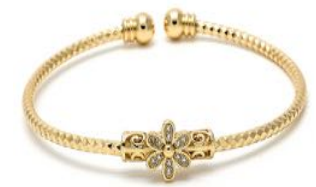
GOLD LAYERED 07.63.0177 INDIVIDUAL BANGLE, FLOWER DESIGN, WITH WHITE MICRO PAVE, GOLD TONE