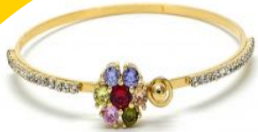
GOLD LAYERED 07.97.0035 INDIVIDUAL BANGLE, FLOWER DESIGN, WITH CUBIC ZIRCONIA, GOLD TONE