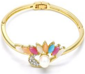
GOLD LAYERED 07.65.0215.1.05 INDIVIDUAL BANGLE, WITH MULTICOLOR AND IVORY OPAL AND IVORY PEARL, POLISHED FINISH, GOLD TONE (21 MM THICKNESS, SIZE 5 - 2.50 INCHES DIAMETER)