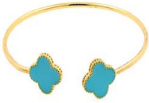
GOLD LAYERED 07.60.0002.1 INDIVIDUAL BANGLE, FLOWER DESIGN, TURQUOISE ENAMEL FINISH, GOLD TONE (14 MM THICKNESS, ONE SIZE FITS ALL)