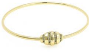
GOLD LAYERED 07.195.0002 INDIVIDUAL BANGLE, WITH WHITE MICRO PAVE, POLISHED FINISH, GOLD TONE (60 MM THICKNESS, ONE SIZE FITS ALL)