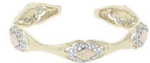
GOLD LAYERED 07.156.0018.1 INDIVIDUAL BANGLE, DIAMOND CUTTING FINISH, TRI TONE (9 MM THICKNESS, ONE SIZE FITS ALL)