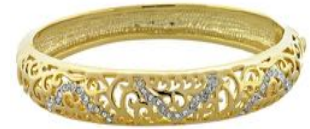
GOLD LAYERED 07.59.0030 INDIVIDUAL BANGLE, FILIGREE DESIGN, WITH CRYSTAL, TWO TONE