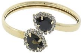
GOLD LAYERED 5.231.015 INDIVIDUAL BANGLE, WITH CUBIC ZIRCONIA, GOLD TONE