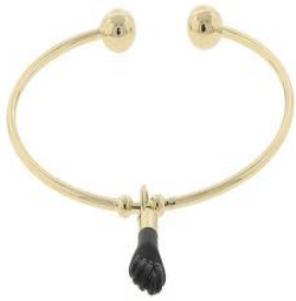
GOLD LAYERED 07.63.0115 INDIVIDUAL BANGLE, GOLD TONE