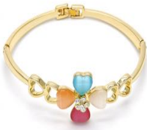
GOLD LAYERED 07.65.0213.1.04 INDIVIDUAL BANGLE, FLOWER AND HEART DESIGN, WITH MULTICOLOR AND WHITE OPAL AND WHITE CRYSTAL, POLISHED FINISH, GOLD TONE (19 MM THICKNESS, SIZE 4 - 2.2