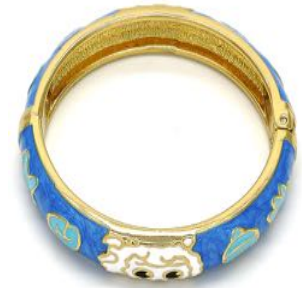
GOLD LAYERED 07.240.0007.03 INDIVIDUAL BANGLE, BLUE ENAMEL FINISH, GOLD TONE (10 MM THICKNESS, SIZE 3 - 2.00 INCHES DIAMETER)