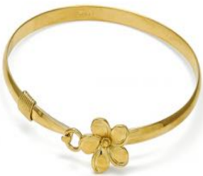
GOLD LAYERED 07.192.0019.06 INDIVIDUAL BANGLE, FLOWER DESIGN, DIAMOND CUTTING FINISH, GOLD TONE (17 MM THICKNESS, SIZE 6 - 2.75 INCHES DIAMETER)