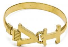
GOLD LAYERED 07.192.0011.03 INDIVIDUAL BANGLE, ANCHOR DESIGN, POLISHED FINISH, GOLD TONE (15 MM THICKNESS, SIZE 3 - 2.00 INCHES DIAMETER)