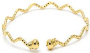
GOLD LAYERED 07.165.0006 INDIVIDUAL BANGLE, TWIST DESIGN, DIAMOND CUTTING FINISH, GOLD TONE (ONE SIZE FITS ALL)