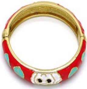
GOLD LAYERED 07.240.0007.4.03 INDIVIDUAL BANGLE, ORANGE ENAMEL FINISH, GOLD TONE (10 MM THICKNESS, SIZE 3 - 2.00 INCHES DIAMETER)