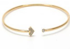
GOLD LAYERED 07.198.0004 INDIVIDUAL BANGLE, HEART DESIGN, WITH MICRO PAVE, GOLD TONE (ONE SIZE FITS ALL)