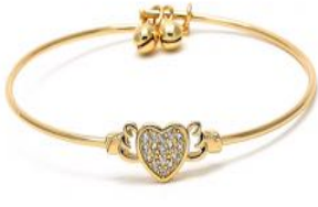
GOLD LAYERED 07.193.0008 INDIVIDUAL BANGLE, HEART AND RATTLE CHARM DESIGN, WITH WHITE MICRO PAVE, POLISHED FINISH, GOLD TONE (1 MM THICKNESS, ONE SIZE FITS ALL)