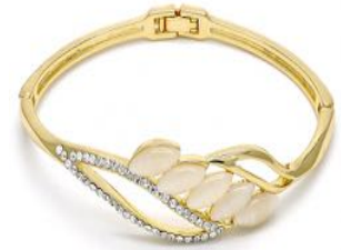
GOLD LAYERED 07.65.0206.05 INDIVIDUAL BANGLE, LEAF DESIGN, WITH IVORY AND WHITE OPAL AND WHITE CRYSTAL, POLISHED FINISH, GOLD TONE (18 MM THICKNESS, SIZE 5 - 2.50 INCHES DIAMETER)