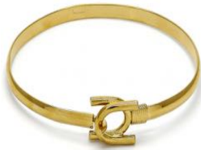
GOLD LAYERED 07.192.0010.06 INDIVIDUAL BANGLE, POLISHED FINISH, GOLD TONE (14 MM THICKNESS, SIZE 6 - 2.75 INCHES DIAMETER)