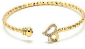
GOLD LAYERED 07.193.0012 INDIVIDUAL BANGLE, HEART DESIGN, WITH WHITE AND WHITE CUBIC ZIRCONIA, DIAMOND CUTTING FINISH, GOLD TONE (2 MM THICKNESS, ONE SIZE FITS ALL)