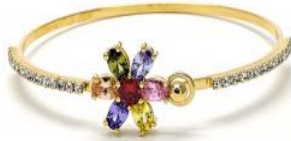
GOLD LAYERED 07.97.0033 INDIVIDUAL BANGLE, FLOWER DESIGN, WITH CUBIC ZIRCONIA, GOLD TONE