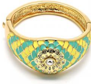
GOLD LAYERED 07.91.0003 INDIVIDUAL BANGLE, FLOWER DESIGN, WITH WHITE CRYSTAL, MULTICOLOR ENAMEL FINISH, GOLD TONE (60 MM THICKNESS, SIZE 5 - 2.50 INCHES DIAMETER)