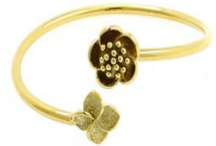
GOLD LAYERED 07.192.0005 INDIVIDUAL BANGLE, FLOWER DESIGN, POLISHED FINISH, GOLD TONE (60 MM THICKNESS, ONE SIZE FITS ALL)