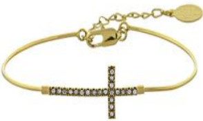
GOLD LAYERED 07.165.0003 INDIVIDUAL BANGLE, CROSS DESIGN, WITH WHITE CUBIC ZIRCONIA, POLISHED FINISH, GOLD TONE (1 MM THICKNESS, SIZE 5 - 2.50 INCHES DIAMETER)