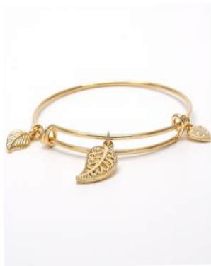
GOLD LAYERED 07.63.0123 INDIVIDUAL BANGLE DESIGN, GOLD TONE