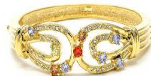
GOLD LAYERED 07.59.0038 INDIVIDUAL BANGLE, WITH CUBIC ZIRCONIA, GOLD TONE