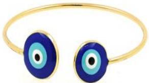
GOLD LAYERED 07.60.0001 INDIVIDUAL BANGLE, GREEK EYE DESIGN, BLUE ENAMEL FINISH, GOLD TONE (60 MM THICKNESS, ONE SIZE FITS ALL)