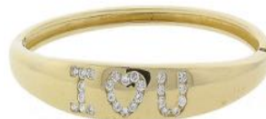
GOLD LAYERED 5.230.005 INDIVIDUAL BANGLE, WITH CRYSTAL, GOLD TONE