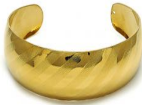
GOLD LAYERED 07.101.0002 INDIVIDUAL BANGLE, DIAMOND CUTTING FINISH, GOLD TONE (24 MM THICKNESS, ONE SIZE FITS ALL)