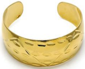
GOLD LAYERED 07.156.0053.1 INDIVIDUAL BANGLE, DIAMOND CUTTING FINISH, GOLD TONE (20 MM THICKNESS, ONE SIZE FITS ALL)