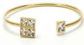
GOLD LAYERED 07.97.0052 INDIVIDUAL BANGLE, WITH CUBIC ZIRCONIA, GOLD TONE