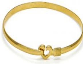
GOLD LAYERED 07.192.0018.06 INDIVIDUAL BANGLE, HEART DESIGN, POLISHED FINISH, GOLD TONE (11 MM THICKNESS, SIZE 6 - 2.75 INCHES DIAMETER)