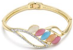
GOLD LAYERED 07.65.0206.1.05 INDIVIDUAL BANGLE, LEAF DESIGN, WITH MULTICOLOR AND WHITE OPAL AND WHITE CRYSTAL, POLISHED FINISH, GOLD TONE (18 MM THICKNESS, SIZE 5 - 2.50 INCHES DIA)