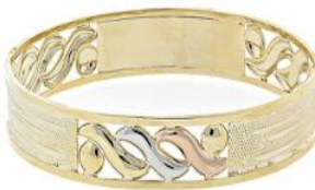
GOLD LAYERED 5.233.001 INDIVIDUAL BANGLE, DIAMOND CUTTING FINISH, GOLD LAYERED 5.233.003.06 TRIO BANGLE, TRI TONE (SIZE 6 - 2.75 INCHES DIAMETER)