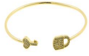
GOLD LAYERED 07.204.0001 INDIVIDUAL BANGLE, KEY AND LOCK DESIGN, WITH WHITE MICRO PAVE, POLISHED FINISH, GOLD TONE (60 MM THICKNESS, ONE SIZE FITS ALL)