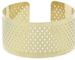
GOLD LAYERED 5.232.008 INDIVIDUAL BANGLE, DIAMOND CUTTING FINISH, GOLD LAYERED 5.232.009 INDIVIDUAL BANGLE, FLOWER DESIGN, DIAMOND CUTTING FINISH, GOLD TONE