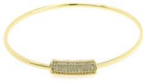
GOLD LAYERED 07.195.0005 INDIVIDUAL BANGLE, WITH WHITE MICRO PAVE, POLISHED FINISH, GOLD TONE (60 MM THICKNESS, ONE SIZE FITS ALL)