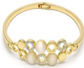
GOLD LAYERED 07.65.0212.04 INDIVIDUAL BANGLE, WITH IVORY AND WHITE OPAL AND WHITE CRYSTAL, POLISHED FINISH, GOLD TONE (16 MM THICKNESS, SIZE 4 - 2.25 INCHES DIAMETER)