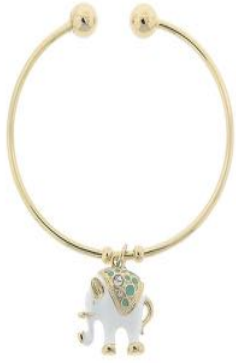
GOLD LAYERED 07.38.0056.4 INDIVIDUAL BANGLE, ELEPHANT DESIGN, ENAMEL FINISH, GOLD TONE