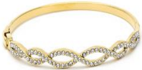
GOLD LAYERED 07.100.0001 INDIVIDUAL BANGLE, WITH WHITE CRYSTAL, POLISHED FINISH, GOLD TONE (4 MM THICKNESS, ONE SIZE FITS ALL)