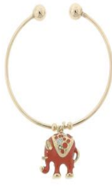
GOLD LAYERED 07.38.0056.5 INDIVIDUAL BANGLE, ELEPHANT DESIGN, ENAMEL FINISH, GOLD TONE