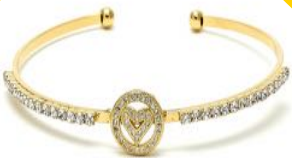
GOLD LAYERED 07.97.0051 INDIVIDUAL BANGLE, WITH CUBIC ZIRCONIA, GOLD TONE