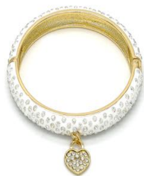
GOLD LAYERED 07.240.0004.1.05 INDIVIDUAL BANGLE, HEART DESIGN, WITH WHITE CRYSTAL, WHITE ENAMEL FINISH, GOLD TONE (10 MM THICKNESS, SIZE 5 - 2.50 INCHES DIAMETER)