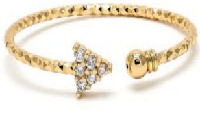
GOLD LAYERED 07.193.0014.1 INDIVIDUAL BANGLE, BALL DESIGN, WITH WHITE CUBIC ZIRCONIA, DIAMOND CUTTING FINISH, GOLD TONE (3 MM THICKNESS, ONE SIZE FITS ALL)