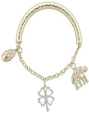
GOLD LAYERED 07.65.0195 SEMANARIO BANGLE, DIAMOND CUTTING FINISH, TRI TONE (SIZE 6 - 2.75 INCHES DIAMETER)