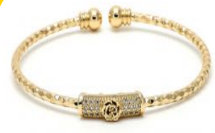
GOLD LAYERED 07.193.0009 INDIVIDUAL BANGLE, FLOWER AND BALL DESIGN, WITH WHITE MICRO PAVE, DIAMOND CUTTING FINISH, GOLD TONE (3 MM THICKNESS, ONE SIZE FITS ALL)