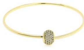
GOLD LAYERED 07.195.0014 INDIVIDUAL BANGLE, BALL DESIGN, WITH WHITE MICRO PAVE, POLISHED FINISH, GOLD TONE (60 MM THICKNESS, ONE SIZE FITS ALL)