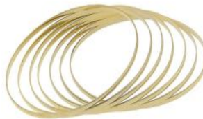
GOLD LAYERED 5.232.002.06 SEMANARIO BANGLE, GOLD TONE (SIZE 6 - 2.75 INCHES DIAMETER)