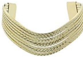
GOLD LAYERED 07.156.0023 INDIVIDUAL BANGLE, DIAMOND CUTTING FINISH, GOLD TONE (13 MM THICKNESS, ONE SIZE FITS ALL)