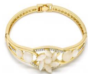
GOLD LAYERED 07.65.0219.05 INDIVIDUAL BANGLE, FLOWER DESIGN, WITH IVORY AND WHITE OPAL AND WHITE CRYSTAL, POLISHED FINISH, GOLD TONE (17 MM THICKNESS, SIZE 5 - 2.50 INCHES DIAMETER)