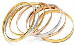
GOLD LAYERED 5.232.005.03 SEMANARIO BANGLE, POLISHED FINISH, TRI TONE (SIZE 3 - 2.00 INCHES DIAMETER)