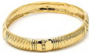
GOLD LAYERED 07.168.0002 INDIVIDUAL BANGLE, DIAMOND CUTTING FINISH, GOLD TONE (ONE SIZE FITS ALL)