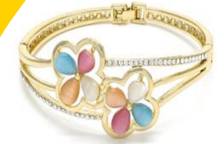
GOLD LAYERED 07.65.0211.1.05 INDIVIDUAL BANGLE, FLOWER DESIGN, WITH MULTICOLOR AND WHITE OPAL AND WHITE CRYSTAL, POLISHED FINISH, GOLD TONE (30 MM THICKNESS, SIZE 5 - 2.50 INCHES D