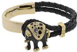
GOLD LAYERED 07.38.0057.2 INDIVIDUAL BANGLE, ELEPHANT DESIGN, WITH WHITE CRYSTAL, BLACK ENAMEL FINISH, GOLD TONE (7 MM THICKNESS, SIZE 5 - 2.50 INCHES DIAMETER)