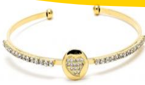
GOLD LAYERED 07.97.0055 INDIVIDUAL BANGLE, WITH CUBIC ZIRCONIA, GOLD TONE