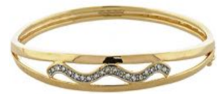
GOLD LAYERED 07.59.0026 INDIVIDUAL BANGLE, TWIST DESIGN, WITH CRYSTAL, GOLD TONE