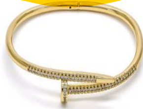
GOLD LAYERED 07.156.0025.05 INDIVIDUAL BANGLE, WITH WHITE CRYSTAL, POLISHED FINISH, GOLD TONE (60 MM THICKNESS, SIZE 5 - 2.50 INCHES DIAMETER)