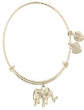
GOLD LAYERED 07.63.0129 INDIVIDUAL BANGLE, GOLD TONE (ONE SIZE FITS ALL)