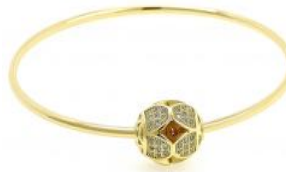
GOLD LAYERED 07.195.0003 INDIVIDUAL BANGLE, CANDY DESIGN, WITH WHITE MICRO PAVE, POLISHED FINISH, GOLD TONE (60 MM THICKNESS, ONE SIZE FITS ALL)