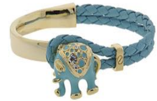
GOLD LAYERED 07.38.0057.1 INDIVIDUAL BANGLE, ELEPHANT DESIGN, WITH WHITE CRYSTAL, ACQUA ENAMEL FINISH, GOLD TONE (8 MM THICKNESS, SIZE 5 - 2.50 INCHES DIAMETER)