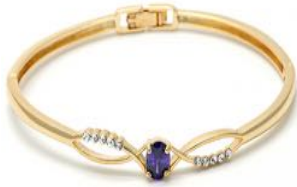
GOLD LAYERED 07.171.0027 INDIVIDUAL BANGLE, WITH DARK AMETHYST AND WHITE CUBIC ZIRCONIA AND WHITE CRYSTAL, POLISHED FINISH, GOLD TONE (3 MM THICKNESS, SIZE 5 - 2.50 INCHES DIAMETER)