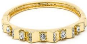
GOLD LAYERED 07.91.0035 INDIVIDUAL BANGLE, WITH CRYSTAL, GOLD TONE