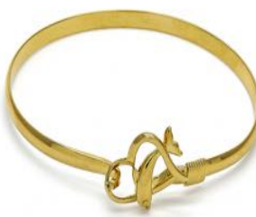
GOLD LAYERED 07.192.0024.06 INDIVIDUAL BANGLE, DOLPHIN AND HEART DESIGN, POLISHED FINISH, GOLD TONE (19 MM THICKNESS, SIZE 6 - 2.75 INCHES DIAMETER)