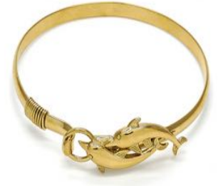
GOLD LAYERED 07.192.0020.05 INDIVIDUAL BANGLE, DOLPHIN DESIGN, POLISHED FINISH, GOLD TONE (18 MM THICKNESS, SIZE 5 - 2.50 INCHES DIAMETER)