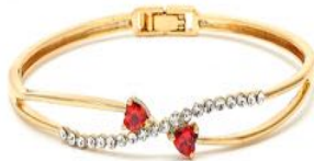
GOLD LAYERED 07.171.0022.1 INDIVIDUAL BANGLE, HEART DESIGN, WITH GARNET AND WHITE CUBIC ZIRCONIA AND WHITE CRYSTAL, POLISHED FINISH, GOLD TONE (3 MM THICKNESS, SIZE 5 - 2.50 INCHES