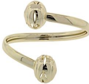
GOLD LAYERED 5.230.012 INDIVIDUAL BANGLE, BALL DESIGN, GOLD TONE