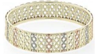
GOLD LAYERED 07.54.0002.06 INDIVIDUAL BANGLE, TRI TONE (SIZE 6 - 2.75 INCHES DIAMETER)