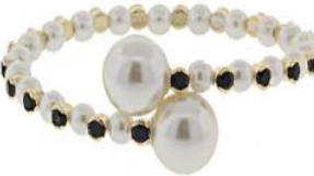
GOLD LAYERED 07.63.0148 INDIVIDUAL BANGLE, BALL DESIGN, WITH PEARL, GOLD TONE