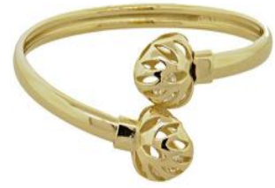
GOLD LAYERED 5.230.010 INDIVIDUAL BANGLE, HEART DESIGN, WITH CRYSTAL, GOLD TONE