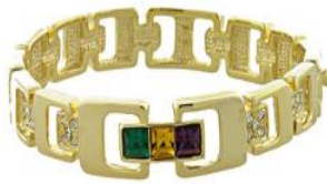
GOLD LAYERED 07.59.0012 INDIVIDUAL BANGLE, WITH CRYSTAL, GOLD