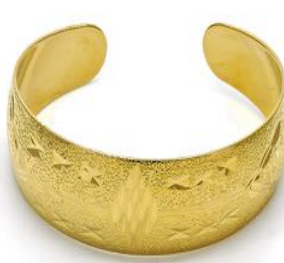
GOLD LAYERED 07.156.0061 INDIVIDUAL BANGLE, DIAMOND CUTTING FINISH, GOLD TONE (20 MM THICKNESS, ONE SIZE FITS ALL)