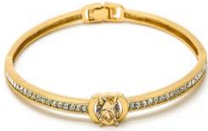
GOLD LAYERED 07.171.0025.2 INDIVIDUAL BANGLE, WITH CHAMPAGNE AND WHITE CUBIC ZIRCONIA, POLISHED FINISH, GOLD TONE (7 MM THICKNESS, SIZE 2 - 1.75 INCHES DIAMETER)