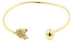
GOLD LAYERED 07.204.0003 INDIVIDUAL BANGLE, OWL AND BALL DESIGN, WITH WHITE AND WHITE CUBIC ZIRCONIA AND WHITE MICRO PAVE, POLISHED FINISH, GOLD TONE (60 MM THICKNESS, ONE SIZE FITS ALL)