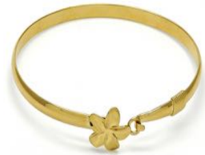
GOLD LAYERED 07.192.0026.06 INDIVIDUAL BANGLE, FLOWER DESIGN, POLISHED FINISH, GOLD TONE (15 MM THICKNESS, SIZE 6 - 2.75 INCHES DIAMETER)