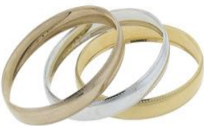
GOLD LAYERED 115.009.05 TRIO BANGLE, TRI TONE (SIZE 5 - 2.50 INCHES DIAMETER)