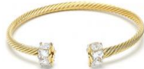
GOLD LAYERED 07.97.0059 INDIVIDUAL BANGLE, WITH WHITE CUBIC ZIRCONIA, DIAMOND CUTTING FINISH, GOLD TONE (8 MM THICKNESS, ONE SIZE FITS ALL)