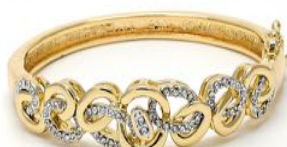
GOLD LAYERED 07.91.0038 INDIVIDUAL BANGLE, WITH CRYSTAL, GOLD TONE