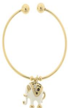
GOLD LAYERED 07.38.0056.1 INDIVIDUAL BANGLE, ELEPHANT DESIGN, ENAMEL FINISH, GOLD TONE