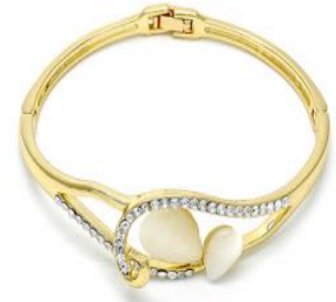
GOLD LAYERED 07.65.0217.05 INDIVIDUAL BANGLE, TEARDROP DESIGN, WITH IVORY AND WHITE OPAL AND WHITE CRYSTAL, POLISHED FINISH, GOLD TONE (16 MM THICKNESS, SIZE 5 - 2.50 INCHES DIAMETER)