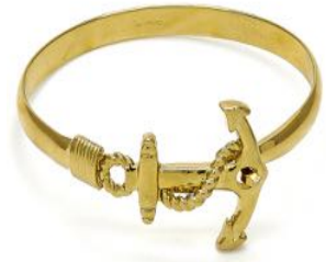
GOLD LAYERED 07.192.0022.03 INDIVIDUAL BANGLE, ANCHOR DESIGN, POLISHED FINISH, GOLD TONE (21 MM THICKNESS, SIZE 3 - 2.00 INCHES DIAMETER)