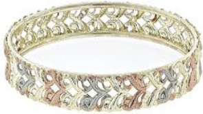
GOLD LAYERED 07.54.0003.05 INDIVIDUAL BANGLE, TRI TONE (SIZE 5 - 2.50 INCHES DIAMETER)