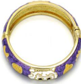
GOLD LAYERED 07.240.0007.5.03 INDIVIDUAL BANGLE, PURPLE ENAMEL FINISH, GOLD TONE (10 MM THICKNESS, SIZE 3 - 2.00 INCHES DIAMETER)