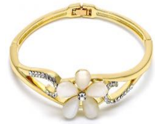
GOLD LAYERED 07.65.0210.05 INDIVIDUAL BANGLE, FLOWER DESIGN, WITH WHITE AND WHITE OPAL AND WHITE CRYSTAL, POLISHED FINISH, GOLD TONE (22 MM THICKNESS, SIZE 5 - 2.50 INCHES DIAMETER