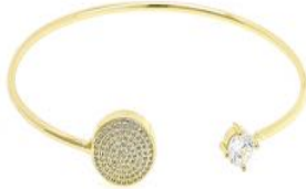
GOLD LAYERED 07.199.0004 INDIVIDUAL BANGLE, WITH WHITE AND WHITE MICRO PAVE AND WHITE CUBIC ZIRCONIA, POLISHED FINISH, GOLD TONE (60 MM THICKNESS, ONE SIZE FITS ALL)