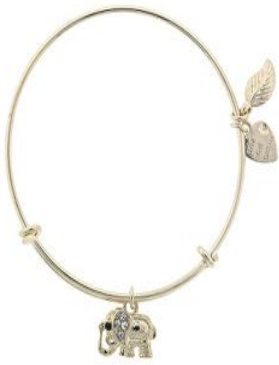
GOLD LAYERED 07.63.0128 INDIVIDUAL BANGLE, ELEPHANT DESIGN, WITH CRYSTAL, GOLD TONE