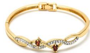
GOLD LAYERED 07.171.0024.1 INDIVIDUAL BANGLE, INFINITE DESIGN, WITH GARNET AND WHITE CUBIC ZIRCONIA AND WHITE CRYSTAL, POLISHED FINISH, GOLD TONE (3 MM THICKNESS, SIZE 4 - 2.25 INC