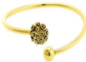
GOLD LAYERED 07.192.0007 INDIVIDUAL BANGLE, SPIRAL AND BALL DESIGN, POLISHED FINISH, GOLD TONE (50 MM THICKNESS, ONE SIZE FITS ALL)