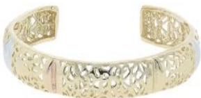
GOLD LAYERED 07.156.0017 INDIVIDUAL BANGLE, DIAMOND CUTTING FINISH, TRI TONE