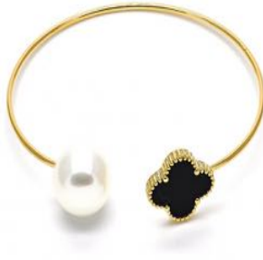
GOLD LAYERED 07.182.0002 INDIVIDUAL BANGLE, FLOWER DESIGN, WITH BLACK AND IVORY OPAL AND IVORY PEARL, POLISHED FINISH, GOLD TONE (1 MM THICKNESS, ONE SIZE FITS ALL)