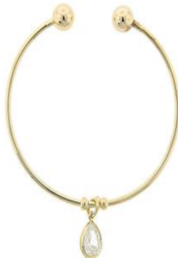
GOLD LAYERED 07.63.0112 INDIVIDUAL BANGLE, WITH CRYSTAL, GOLD TONE