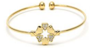
GOLD LAYERED 07.63.0174 INDIVIDUAL BANGLE, WITH MICRO PAVE, GOLD TONE