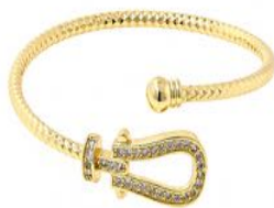
GOLD LAYERED 07.192.0003 INDIVIDUAL BANGLE, BELT BUCKLE AND BALL DESIGN, WITH WHITE CUBIC ZIRCONIA, DIAMOND CUTTING FINISH, GOLD TONE (3 MM THICKNESS, ONE SIZE FITS ALL)