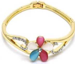
GOLD LAYERED 07.65.0210.1.05 INDIVIDUAL BANGLE, FLOWER DESIGN, WITH MULTICOLOR AND WHITE OPAL AND WHITE CRYSTAL, POLISHED FINISH, GOLD TONE (22 MM THICKNESS, SIZE 5 - 2.50 INCHES D