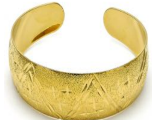
GOLD LAYERED 07.156.0060 INDIVIDUAL BANGLE, DIAMOND CUTTING FINISH, GOLD TONE (20 MM THICKNESS, ONE SIZE FITS ALL)