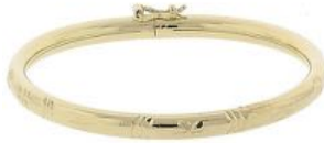
GOLD LAYERED 5.231.016 INDIVIDUAL BANGLE, DIAMOND CUTTING FINISH, GOLD TONE (4 MM THICKNESS, SIZE 5 - 2.50 INCHES DIAMETER)