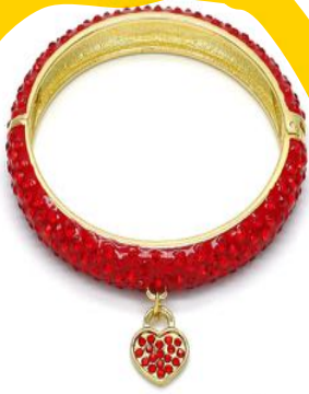
GOLD LAYERED 07.240.0004.3.05 INDIVIDUAL BANGLE, HEART DESIGN, WITH GARNET CRYSTAL, RED ENAMEL FINISH, GOLD TONE (10 MM THICKNESS, SIZE 5 - 2.50 INCHES DIAMETER)