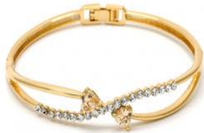
GOLD LAYERED 07.171.0022 INDIVIDUAL BANGLE, HEART DESIGN, WITH CHAMPAGNE AND WHITE CUBIC ZIRCONIA AND WHITE CRYSTAL, POLISHED FINISH, GOLD TONE (4 MM THICKNESS, SIZE 5 - 2.50 INCHES