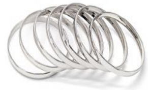
GOLD LAYERED 5.232.004.1.01 SEMANARIO BANGLE, POLISHED FINISH, RHODIUM TONE (SIZE 1 - 1.50 INCHES DIAMETER)