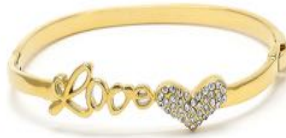
GOLD LAYERED 07.100.0003 INDIVIDUAL BANGLE, LOVE AND HEART DESIGN, WITH WHITE CRYSTAL, POLISHED FINISH, GOLD TONE (5 MM THICKNESS, SIZE 4 - 2.25 INCHES DIAMETER)