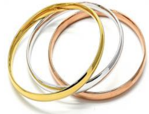
GOLD LAYERED 07.165.0005.2 TRIO BANGLE, POLISHED FINISH, TRI TONE (6 MM THICKNESS, SIZE 4 - 2.25 INCHES DIAMETER)