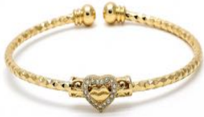
GOLD LAYERED 07.193.0011 INDIVIDUAL BANGLE, HEART DESIGN, WITH WHITE MICRO PAVE, DIAMOND CUTTING FINISH, GOLD TONE (3 MM THICKNESS, ONE SIZE FITS ALL)