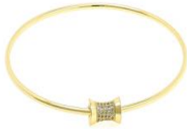
GOLD LAYERED 07.195.0009 INDIVIDUAL BANGLE, WITH WHITE MICRO PAVE, POLISHED FINISH, GOLD TONE (60 MM THICKNESS, ONE SIZE FITS ALL)