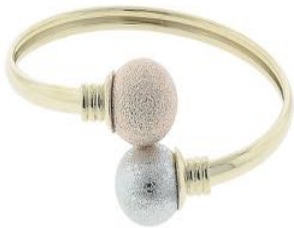
GOLD LAYERED 5.230.014 INDIVIDUAL BANGLE, BALL DESIGN, DIAMOND CUTTING FINISH, TRI TONE