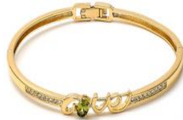
GOLD LAYERED 07.171.0019.2 INDIVIDUAL BANGLE, LOVE DESIGN, WITH DARK PERIDOT AND WHITE CUBIC ZIRCONIA AND WHITE CRYSTAL, POLISHED FINISH, GOLD TONE (3 MM THICKNESS, SIZE 5 - 2.50 I