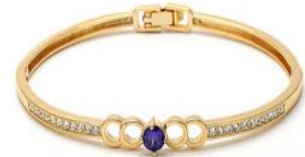
GOLD LAYERED 07.171.0023 INDIVIDUAL BANGLE, WITH AMETHYST AND WHITE CUBIC ZIRCONIA AND WHITE CRYSTAL, POLISHED FINISH, GOLD TONE (3 MM THICKNESS, SIZE 5 - 2.50 INCHES DIAMETER)