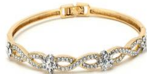
GOLD LAYERED 07.171.0029 INDIVIDUAL BANGLE, FLOWER DESIGN, WITH WHITE CRYSTAL, POLISHED FINISH, GOLD TONE (60 MM THICKNESS, SIZE 5 - 2.50 INCHES DIAMETER)