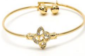
GOLD LAYERED 07.193.0007 INDIVIDUAL BANGLE, FLOWER AND RATTLE CHARM DESIGN, WITH WHITE MICRO PAVE, POLISHED FINISH, GOLD TONE (2 MM THICKNESS, ONE SIZE FITS ALL)