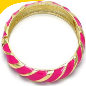
GOLD LAYERED 07.240.0001.3.05 INDIVIDUAL BANGLE, PINK ENAMEL FINISH, GOLD TONE (10 MM THICKNESS, SIZE 5 - 2.50 INCHES DIAMETER)