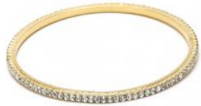
GOLD LAYERED 07.97.0049 INDIVIDUAL BANGLE, WITH CUBIC ZIRCONIA, GOLD TONE