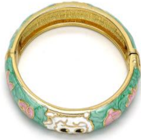
GOLD LAYERED 07.240.0007.2.03 INDIVIDUAL BANGLE, GREEN ENAMEL FINISH, GOLD TONE (10 MM THICKNESS, SIZE 3 - 2.00 INCHES DIAMETER)