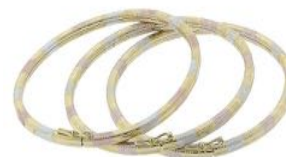
GOLD LAYERED 07.38.0020 TRIO BANGLE, DIAMOND CUTTING FINISH, TRI TONE