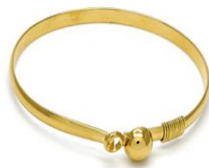
GOLD LAYERED 07.192.0023.06 INDIVIDUAL BANGLE, POLISHED FINISH, GOLD TONE (10 MM THICKNESS, SIZE 6 - 2.75 INCHES DIAMETER)