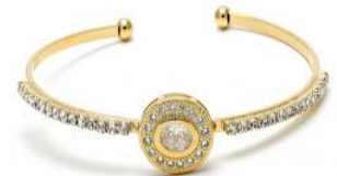
GOLD LAYERED 07.97.0036.1 INDIVIDUAL BANGLE, WITH WHITE AND WHITE MICRO PAVE AND WHITE CUBIC ZIRCONIA, POLISHED FINISH, GOLD TONE (2 MM THICKNESS, SIZE 4 - 2.25 INCHES DIAMETER)