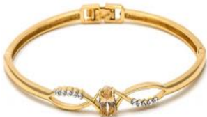
GOLD LAYERED 07.171.0027.3 INDIVIDUAL BANGLE, WITH CHAMPAGNE AND WHITE CUBIC ZIRCONIA AND WHITE CRYSTAL, POLISHED FINISH, GOLD TONE (3 MM THICKNESS, SIZE 5 - 2.50 INCHES DIAMETER)