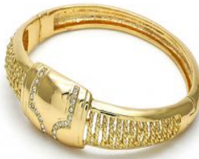
GOLD LAYERED 07.91.0044.05 INDIVIDUAL BANGLE, TWIST DESIGN, WITH WHITE CRYSTAL, POLISHED FINISH, GOLD TONE (60 MM THICKNESS, SIZE 5 - 2.50 INCHES DIAMETER)