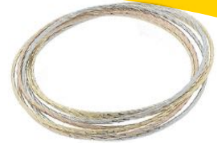
GOLD LAYERED 5.233.014 SEMANARIO BANGLE, DIAMOND CUTTING FINISH, TRI TONE