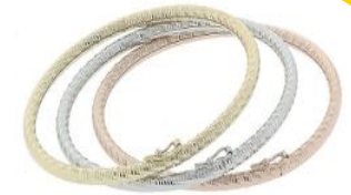
GOLD LAYERED 5.232.001.05 TRIO BANGLE, DIAMOND CUTTING FINISH, TRI TONE (SIZE 5 - 2.50 INCHES DIAMETER)