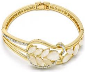
GOLD LAYERED 07.65.0220.05 INDIVIDUAL BANGLE, TEARDROP AND LEAF DESIGN, WITH IVORY AND WHITE OPAL AND WHITE CRYSTAL, POLISHED FINISH, GOLD TONE (20 MM THICKNESS, SIZE 5 - 2.50 INCH)