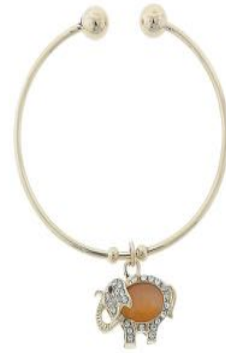
GOLD LAYERED 07.63.0106 INDIVIDUAL BANGLE, ELEPHANT AND BALL DESIGN, WITH TOPAZ AND WHITE OPAL AND WHITE CRYSTAL, POLISHED FINISH, GOLD TONE (2 MM THICKNESS, ONE SIZE FITS ALL)