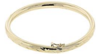
GOLD LAYERED 5.231.019.1 INDIVIDUAL BANGLE, DIAMOND CUTTING FINISH, GOLD TONE