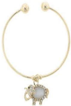
GOLD LAYERED 07.63.0107 INDIVIDUAL BANGLE, ELEPHANT AND BALL DESIGN, WITH DARK CHAMPAGNE AND WHITE OPAL AND WHITE CRYSTAL, POLISHED FINISH, GOLD TONE (2 MM THICKNESS, ONE SIZE FITS AL