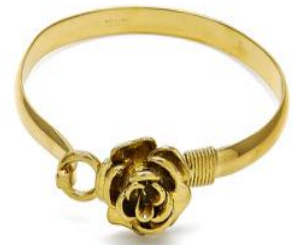
GOLD LAYERED 07.192.0016.03 INDIVIDUAL BANGLE, FLOWER DESIGN, POLISHED FINISH, GOLD TONE (17 MM THICKNESS, SIZE 3 - 2.00 INCHES DIAMETER)