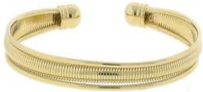
GOLD LAYERED 5.229.004 INDIVIDUAL BANGLE, DIAMOND CUTTING FINISH, GOLD TONE