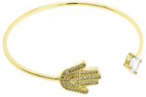
GOLD LAYERED 07.199.0003 INDIVIDUAL BANGLE, HAND DESIGN, WITH WHITE AND WHITE MICRO PAVE AND WHITE CUBIC ZIRCONIA, POLISHED FINISH, GOLD TONE (55 MM THICKNESS, ONE SIZE FITS ALL)