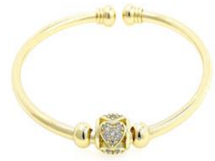
GOLD LAYERED 07.192.0008 INDIVIDUAL BANGLE, HEART DESIGN, WITH WHITE CUBIC ZIRCONIA, POLISHED FINISH, GOLD TONE (50 MM THICKNESS, ONE SIZE FITS ALL)