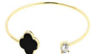
GOLD LAYERED 07.195.0013 INDIVIDUAL BANGLE, FLOWER DESIGN, WITH BLACK AND WHITE OPAL AND WHITE CUBIC ZIRCONIA, POLISHED FINISH, GOLD TONE (2 MM THICKNESS, ONE SIZE FITS ALL)