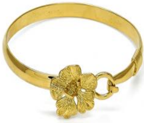
GOLD LAYERED 07.192.0021.03 INDIVIDUAL BANGLE, FLOWER DESIGN, POLISHED FINISH, GOLD TONE (17 MM THICKNESS, SIZE 3 - 2.00 INCHES DIAMETER)