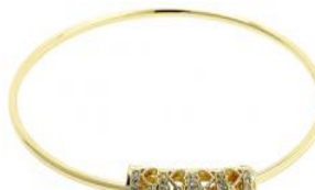
GOLD LAYERED 07.195.0006 INDIVIDUAL BANGLE, WITH WHITE MICRO PAVE, POLISHED FINISH, GOLD TONE (60 MM THICKNESS, ONE SIZE FITS ALL)