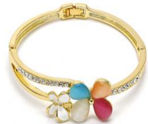
GOLD LAYERED 07.65.0207.1.05 INDIVIDUAL BANGLE, BUTTERFLY AND FLOWER DESIGN, WITH MULTICOLOR AND WHITE OPAL AND WHITE CRYSTAL, WHITE ENAMEL FINISH, GOLD TONE (17 MM THICKNESS, SIZE 5 - 2)