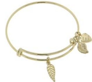
GOLD LAYERED 07.63.0133 INDIVIDUAL BANGLE, GOLD TONE