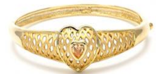
GOLD LAYERED 07.59.0039 INDIVIDUAL BANGLE, HEART DESIGN, WITH DARK CHAMPAGNE CRYSTAL, MATTE FINISH, GOLD TONE (17 MM THICKNESS, SIZE 5 - 2.50 INCHES DIAMETER)