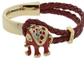
GOLD LAYERED 07.38.0057 INDIVIDUAL BANGLE, ELEPHANT DESIGN, WITH WHITE CRYSTAL, RED ENAMEL FINISH, GOLD TONE (7 MM THICKNESS, SIZE 4 - 2.25 INCHES DIAMETER)