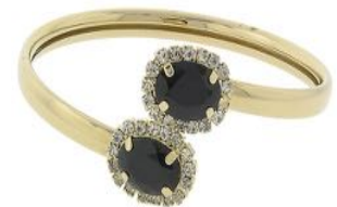
GOLD LAYERED 5.231.010 INDIVIDUAL BANGLE, WITH CUBIC ZIRCONIA, GOLD TONE