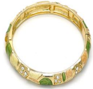
GOLD LAYERED 07.240.0005.1.05 INDIVIDUAL BANGLE, WITH WHITE CRYSTAL, GREEN ENAMEL FINISH, GOLD TONE (10 MM THICKNESS, SIZE 5 - 2.50 INCHES DIAMETER)