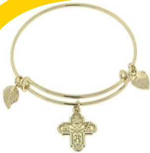
GOLD LAYERED 07.63.0125 INDIVIDUAL BANGLE DESIGN, DIAMOND CUTTING FINISH, GOLD TONE