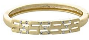
GOLD LAYERED 07.91.0024 INDIVIDUAL BANGLE, WITH CUBIC ZIRCONIA, GOLD TONE