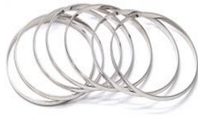
GOLD LAYERED 5.232.002.1.01 SEMANARIO BANGLE, POLISHED FINISH, RHODIUM TONE (SIZE 1 - 1.50 INCHES DIAMETER)