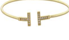
GOLD LAYERED 07.198.0001 INDIVIDUAL BANGLE, WITH CRYSTAL, GOLD TONE