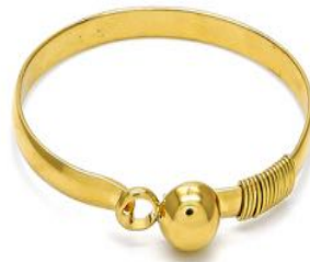
GOLD LAYERED 07.192.0023.03 INDIVIDUAL BANGLE, POLISHED FINISH, GOLD TONE (10 MM THICKNESS, SIZE 3 - 2.00 INCHES DIAMETER)