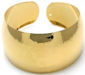
GOLD LAYERED 07.165.0007 INDIVIDUAL BANGLE, GOLD TONE (ONE SIZE FITS ALL)