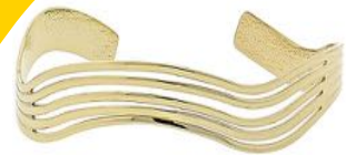
GOLD LAYERED 5.229.003.1 INDIVIDUAL BANGLE, POLISHED FINISH, GOLD TONE (1 MM THICKNESS, SIZE 5 - 2.50 INCHES DIAMETER)