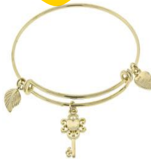
GOLD LAYERED 07.63.0126 INDIVIDUAL BANGLE DESIGN, GOLD TONE