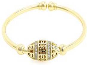
GOLD LAYERED 07.192.0009 INDIVIDUAL BANGLE, WITH WHITE CUBIC ZIRCONIA, POLISHED FINISH, GOLD TONE (50 MM THICKNESS, ONE SIZE FITS ALL)