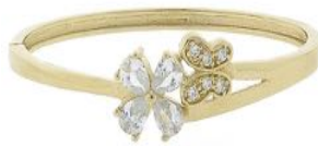
GOLD LAYERED 07.97.0011 INDIVIDUAL BANGLE, FLOWER DESIGN, WITH CUBIC ZIRCONIA, GOLD TONE