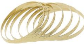
GOLD LAYERED 116.005.05 SEMANARIO BANGLE, GOLD TONE (SIZE 5 - 2.50 INCHES DIAMETER)