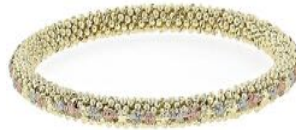
GOLD LAYERED 07.54.0008.05 INDIVIDUAL BANGLE, DIAMOND CUTTING FINISH, TRI TONE (SIZE 5 - 2.50 INCHES DIAMETER)