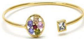
GOLD LAYERED 07.97.0058 INDIVIDUAL BANGLE, FLOWER DESIGN, WITH MULTICOLOR AND WHITE CUBIC ZIRCONIA AND WHITE CRYSTAL, POLISHED FINISH, GOLD TONE (2 MM THICKNESS, SIZE 3 - 2.00 INCH)