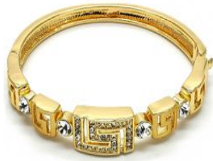
GOLD LAYERED 07.91.0045.05 INDIVIDUAL BANGLE, GREEK KEY DESIGN, WITH WHITE AND WHITE CUBIC ZIRCONIA AND WHITE CRYSTAL, POLISHED FINISH, GOLD TONE (60 MM THICKNESS, SIZE 5 - 2.50 IN)