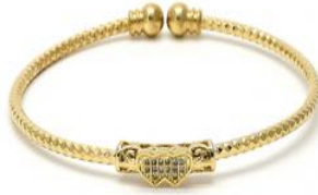
GOLD LAYERED 07.63.0179 INDIVIDUAL BANGLE, HEART DESIGN, WITH WHITE MICRO PAVE, DIAMOND CUTTING FINISH, GOLD TONE