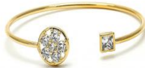
GOLD LAYERED 07.97.0058.1 INDIVIDUAL BANGLE, FLOWER DESIGN, WITH WHITE AND WHITE CUBIC ZIRCONIA AND WHITE CRYSTAL, POLISHED FINISH, GOLD TONE (2 MM THICKNESS, SIZE 4 - 2.25 INCHES)