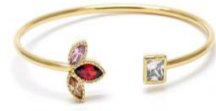
GOLD LAYERED 07.97.0053 INDIVIDUAL BANGLE, WITH CUBIC ZIRCONIA, GOLD TONE