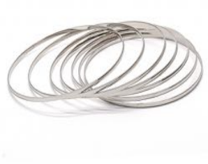
GOLD LAYERED 5.232.002.1.06 SEMANARIO BANGLE, POLISHED FINISH, RHODIUM TONE (2 MM THICKNESS, SIZE 6)