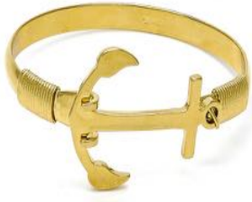
GOLD LAYERED 07.192.0012.03 INDIVIDUAL BANGLE, ANCHOR DESIGN, POLISHED FINISH, GOLD TONE (25 MM THICKNESS, SIZE 3 - 2.00 INCHES DIAMETER)