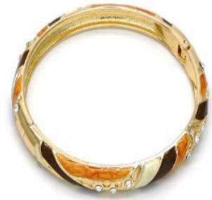
GOLD LAYERED 07.240.0003.2.04 INDIVIDUAL BANGLE, WITH WHITE CRYSTAL, MULTICOLOR ENAMEL FINISH, GOLD TONE (8 MM THICKNESS, SIZE 4 - 2.25 INCHES DIAMETER)