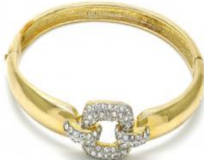
GOLD LAYERED 07.59.0059.05 INDIVIDUAL BANGLE, WITH WHITE CRYSTAL, POLISHED FINISH, TWO TONE (60 MM THICKNESS, SIZE 5 - 2.50 INCHES DIAMETER)