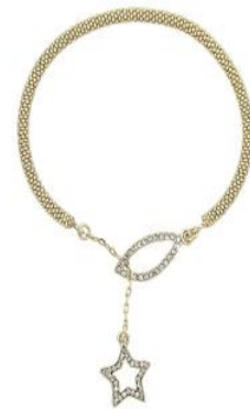
GOLD LAYERED 07.91.0025 INDIVIDUAL BANGLE, STAR DESIGN, WITH MICRO PAVE, GOLD TONE