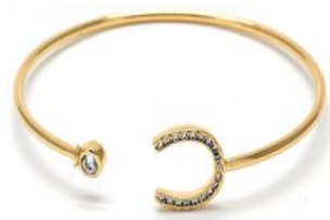
GOLD LAYERED 07.198.0003 INDIVIDUAL BANGLE, WITH CUBIC ZIRCONIA, GOLD TONE (ONE SIZE FITS ALL)