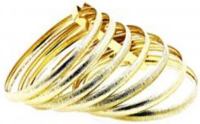
GOLD LAYERED 07.59.0049.06 SEMANARIO BANGLE, GREEK KEY DESIGN, DIAMOND CUTTING FINISH, GOLD TONE (6 MM THICKNESS, SIZE 6 - 2.75 INCHES DIAMETER)