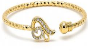
GOLD LAYERED 07.193.0013.1 INDIVIDUAL BANGLE, HEART DESIGN, WITH WHITE MICRO PAVE, DIAMOND CUTTING FINISH, GOLD TONE (ONE SIZE FITS ALL)