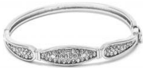
GOLD LAYERED 07.100.0002.1 INDIVIDUAL BANGLE, WITH WHITE CRYSTAL, POLISHED FINISH, RHODIUM TONE (4 MM THICKNESS, SIZE 4 - 2.25 INCHES DIAMETER)