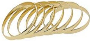
GOLD LAYERED 5.232.004.02 SEMANARIO BANGLE, TRI TONE (SIZE 2 - 1.75 INCHES DIAMETER)