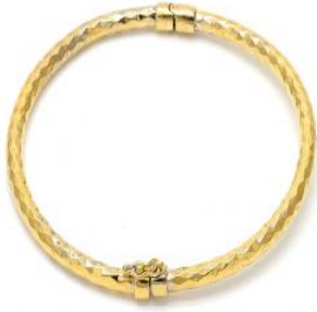
GOLD LAYERED 07.168.0004 INDIVIDUAL BANGLE, DIAMOND CUTTING FINISH, GOLD TONE (ONE SIZE FITS ALL)