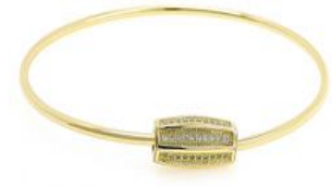
GOLD LAYERED 07.195.0004 INDIVIDUAL BANGLE, WITH WHITE MICRO PAVE, POLISHED FINISH, GOLD TONE (60 MM THICKNESS, ONE SIZE FITS ALL)