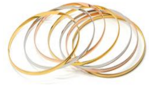
GOLD LAYERED 5.232.003.03 SEMANARIO BANGLE, POLISHED FINISH, TRI TONE (SIZE 3 - 2.00 INCHES DIAMETER)