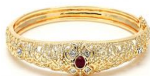
GOLD LAYERED 07.59.0033 INDIVIDUAL BANGLE, FILIGREE DESIGN, WITH CUBIC ZIRCONIA, GOLD TONE