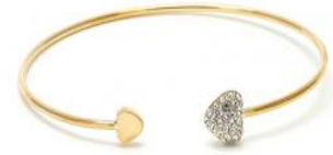
GOLD LAYERED 07.182.0004 INDIVIDUAL BANGLE, HEART DESIGN, WITH CRYSTAL, GOLD TONE