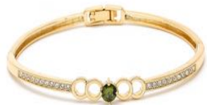
GOLD LAYERED 07.171.0023.2 INDIVIDUAL BANGLE, WITH DARK PERIDOT AND WHITE CUBIC ZIRCONIA AND WHITE CRYSTAL, POLISHED FINISH, GOLD TONE (3 MM THICKNESS, SIZE 5 - 2.50 INCHES DIAMETER)