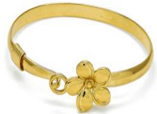
GOLD LAYERED 07.192.0019.03 INDIVIDUAL BANGLE, FLOWER DESIGN, DIAMOND CUTTING FINISH, GOLD TONE (14 MM THICKNESS, SIZE 3 - 2.00 INCHES DIAMETER)