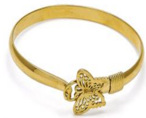
GOLD LAYERED 07.192.0025.03 INDIVIDUAL BANGLE, BUTTERFLY DESIGN, POLISHED FINISH, GOLD TONE (16 MM THICKNESS, SIZE 3 - 2.00 INCHES DIAMETER)