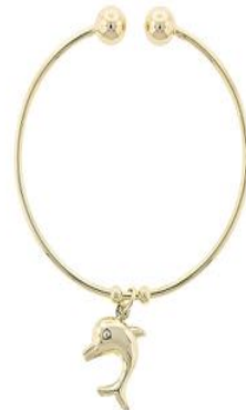
GOLD LAYERED 07.63.0114 INDIVIDUAL BANGLE, DOLPHIN DESIGN, POLISHED FINISH, GOLD TONE