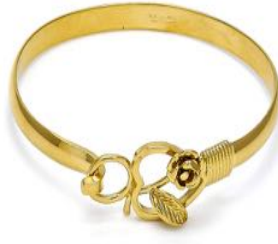
GOLD LAYERED 07.192.0017.03 INDIVIDUAL BANGLE, FLOWER AND HEART DESIGN, POLISHED FINISH, GOLD TONE (12 MM THICKNESS, SIZE 3 - 2.00 INCHES DIAMETER)