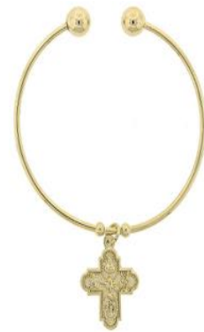
GOLD LAYERED 07.63.0138 INDIVIDUAL BANGLE DESIGN, DIAMOND CUTTING FINISH, GOLD TONE