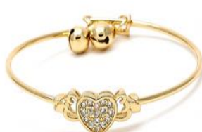
GOLD LAYERED 07.193.0008.1 INDIVIDUAL BANGLE, RATTLE CHARM AND HEART DESIGN, WITH WHITE MICRO PAVE, POLISHED FINISH, GOLD TONE (1 MM THICKNESS, ONE SIZE FITS ALL)