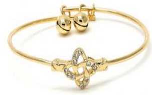
GOLD LAYERED 07.193.0007.1 INDIVIDUAL BANGLE, FLOWER AND RATTLE CHARM DESIGN, WITH WHITE MICRO PAVE, POLISHED FINISH, GOLD TONE (2 MM THICKNESS, ONE SIZE FITS ALL)