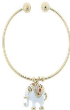
GOLD LAYERED 07.38.0056.2 INDIVIDUAL BANGLE, ELEPHANT DESIGN, ENAMEL FINISH, GOLD TONE