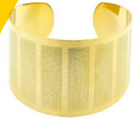
GOLD LAYERED 07.118.0001.05 INDIVIDUAL BANGLE, POLISHED FINISH, GOLD TONE (SIZE 5 - 2.50 INCHES DIAMETER)