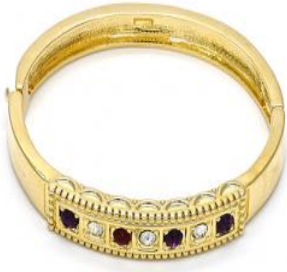
GOLD LAYERED 07.59.0055.05 INDIVIDUAL BANGLE, WITH MULTICOLOR CRYSTAL, POLISHED FINISH, GOLD TONE (60 MM THICKNESS, SIZE 5 - 2.50 INCHES DIAMETER)