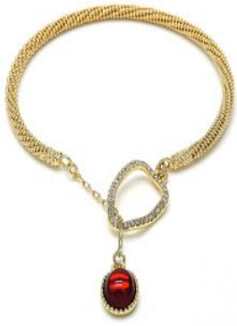
GOLD LAYERED 07.91.0026 INDIVIDUAL BANGLE, WITH MICRO PAVE, GOLD TONE