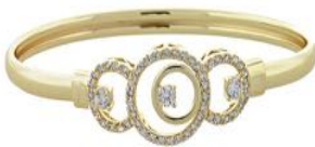
GOLD LAYERED 07.59.0018 INDIVIDUAL BANGLE, WITH CUBIC ZIRCONIA, GOLD TONE