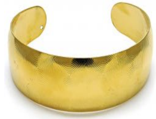
GOLD LAYERED 07.101.0006 INDIVIDUAL BANGLE, POLISHED FINISH, GOLD TONE (25 MM THICKNESS, ONE SIZE FITS ALL)