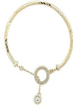
GOLD LAYERED 07.91.0029 INDIVIDUAL BANGLE, WITH MICRO PAVE, GOLD TONE