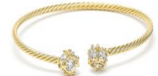
GOLD LAYERED 07.97.0042 INDIVIDUAL BANGLE, TEARDROP DESIGN, WITH CUBIC ZIRCONIA, GOLD TONE