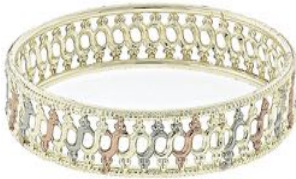
GOLD LAYERED 07.54.0007.06 INDIVIDUAL BANGLE, TRI TONE (SIZE 6 - 2.75 INCHES DIAMETER)