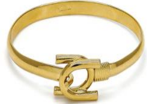
GOLD LAYERED 07.192.0010.03 INDIVIDUAL BANGLE, POLISHED FINISH, GOLD TONE (14 MM THICKNESS, SIZE 3 - 2.00 INCHES DIAMETER)