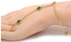
GOLD LAYERED 07.60.0003.1 INDIVIDUAL BANGLE, FLOWER DESIGN, GREEN ENAMEL FINISH, GOLD TONE (55 MM THICKNESS, ONE SIZE FITS ALL)