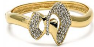
GOLD LAYERED 07.59.0041 INDIVIDUAL BANGLE, BOW DESIGN, WITH WHITE CRYSTAL, POLISHED FINISH, GOLD TONE (ONE SIZE FITS ALL)