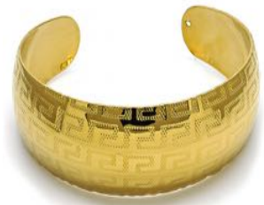
GOLD LAYERED 5.229.013 INDIVIDUAL BANGLE, GREEK KEY DESIGN, POLISHED FINISH, GOLD TONE (24 MM THICKNESS, ONE SIZE FITS ALL)