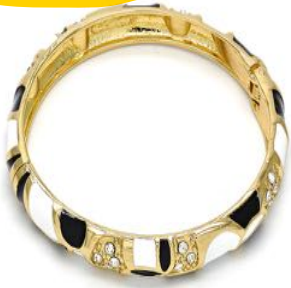
GOLD LAYERED 07.240.0005.2.05 INDIVIDUAL BANGLE, WITH WHITE CRYSTAL, BLACK ENAMEL FINISH, GOLD TONE (10 MM THICKNESS, SIZE 5 - 2.50 INCHES DIAMETER)