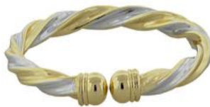
GOLD LAYERED 5.230.015.1 INDIVIDUAL BANGLE, GOLD TONE