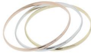
GOLD LAYERED 5.233.009.06 TRIO BANGLE, POLISHED FINISH, TRI TONE (SIZE 6 - 2.75 INCHES DIAMETER)