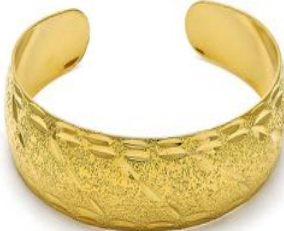
GOLD LAYERED 07.156.0059 INDIVIDUAL BANGLE, DIAMOND CUTTING FINISH, GOLD TONE (20 MM THICKNESS, ONE SIZE FITS ALL)