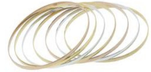
GOLD LAYERED 5.232.003.06 SEMANARIO BANGLE, POLISHED FINISH, TRI TONE (SIZE 6 - 2.75 INCHES DIAMETER)