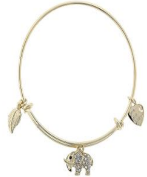
GOLD LAYERED 07.63.0130 INDIVIDUAL BANGLE, ELEPHANT AND LEAF DESIGN, WITH WHITE AND BLACK CRYSTAL, POLISHED FINISH, GOLD TONE