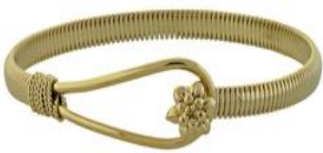
GOLD LAYERED 07.156.0004.1. INDIVIDUAL BANGLE, FLOWER DESIGN, POLISHED FINISH, GOLD TONE (SIZE 4 - 2.25 INCHES DIAMETER)