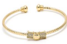
GOLD LAYERED 07.193.0010 INDIVIDUAL BANGLE, APPLE DESIGN, WITH WHITE MICRO PAVE, DIAMOND CUTTING FINISH, GOLD TONE (2 MM THICKNESS, ONE SIZE FITS ALL)