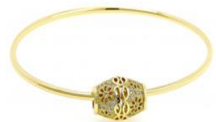
GOLD LAYERED 07.195.0007 INDIVIDUAL BANGLE, WITH WHITE MICRO PAVE, POLISHED FINISH, GOLD TONE (60 MM THICKNESS, ONE SIZE FITS ALL)