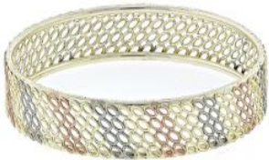
GOLD LAYERED 07.54.0004.06 INDIVIDUAL BANGLE, TRI TONE (SIZE 6 - 2.75 INCHES DIAMETER)