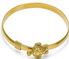
GOLD LAYERED 07.192.0015.06 INDIVIDUAL BANGLE, TURTLE DESIGN, POLISHED FINISH, GOLD TONE (14 MM THICKNESS, SIZE 6 - 2.75 INCHES DIAMETER)