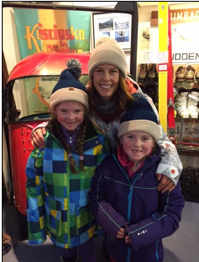
The McDonald children were thrilled to meet Thredbo Ambassador Torah Bright in the Ski Museum.

It is interesting to see the change in the demographics of the visitors to the museum, and the increased interest taken in the history of Thredbo and snow sports. The display of snowboards has attracted many snowboarders, who have been fascinated by the unique collection of wooden skis. The visitors now include people from many parts of the Middle East, the Indian sub continent and Asia. A two page overview of the collection and Australia's ski history is now handed to visitors as they enter the venue.