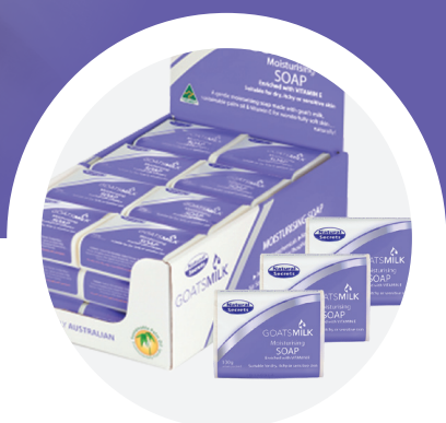
Soap Wraps / Packaging