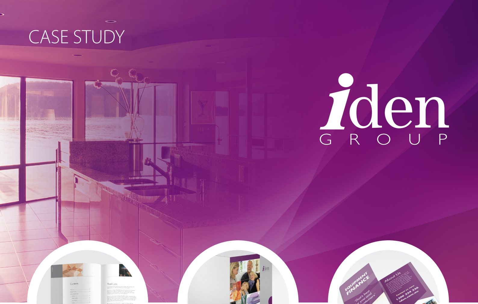
CASE STUDY iden GROUP Contents Introduction 1 Our Services 2 Our Clients 3 Our Values 4 Our Team 5 Our Locations 6 Our History 7 Our Future 8 Our Contact 9 Thank you. We are grateful for your business and the opportunity to serve you. We will continue to strive for excellence in everything we do. Testimonial: "I have been a customer of Iden Group for many years and I can honestly say that they are the best in the business. Their staff are friendly, professional and always go above and beyond to ensure that my needs are met. I highly recommend Iden Group to anyone looking for a reliable and trustworthy service provider." iden EQUIPMENT FINANCE "That's best for you and customers." About Us iden group is a leading provider of equipment finance solutions for businesses across Australia. We offer a range of flexible financing options to help businesses grow and thrive. Contact us now: 1300 334 336 iden.com.au