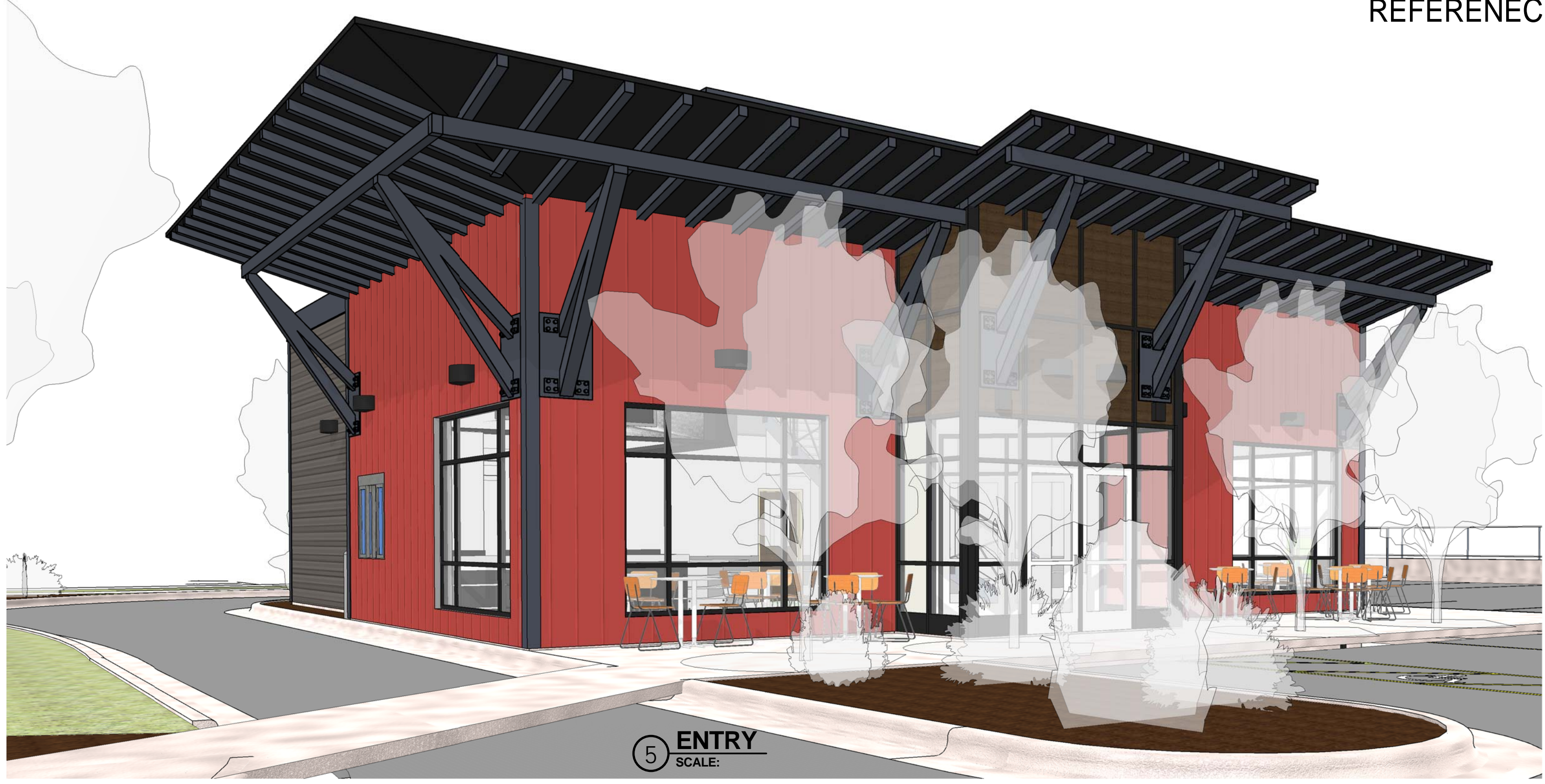
5 ENTRY SCALE:

NOTE: THIS SHEET IS PROVIDED FOR REFERENCE ONLY.