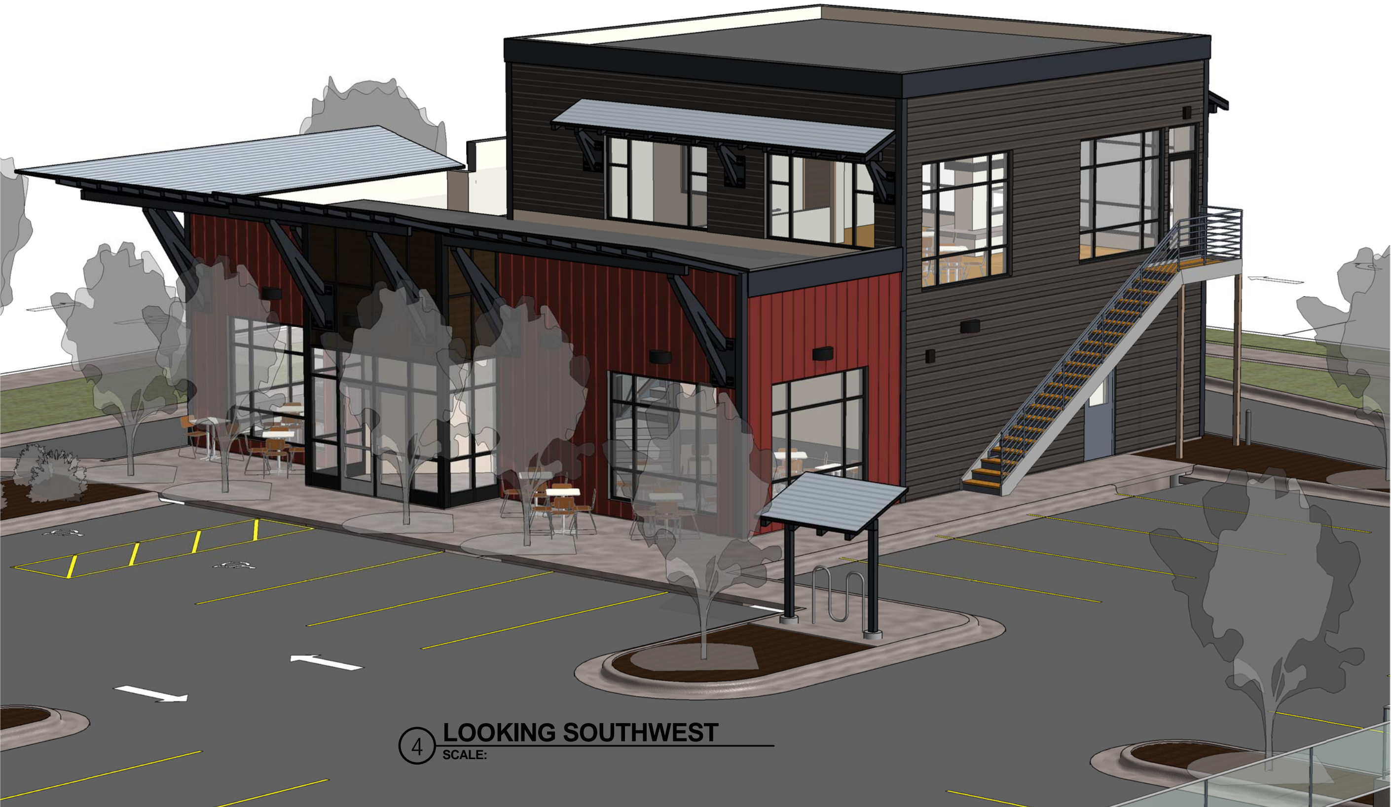
4 LOOKING SOUTHWEST SCALE: