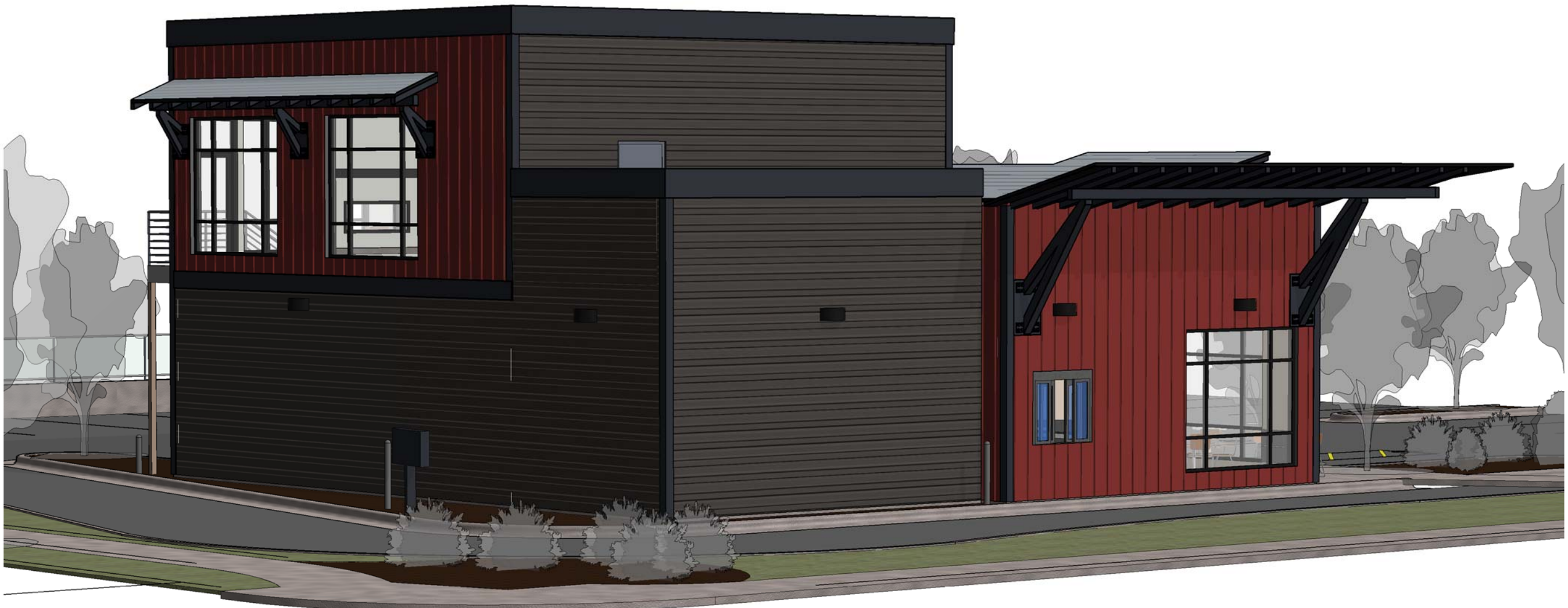
2 LOOKING NORTHEAST SCALE:

NOTE: THIS SHEET IS PROVIDED FOR REFERENCE ONLY.