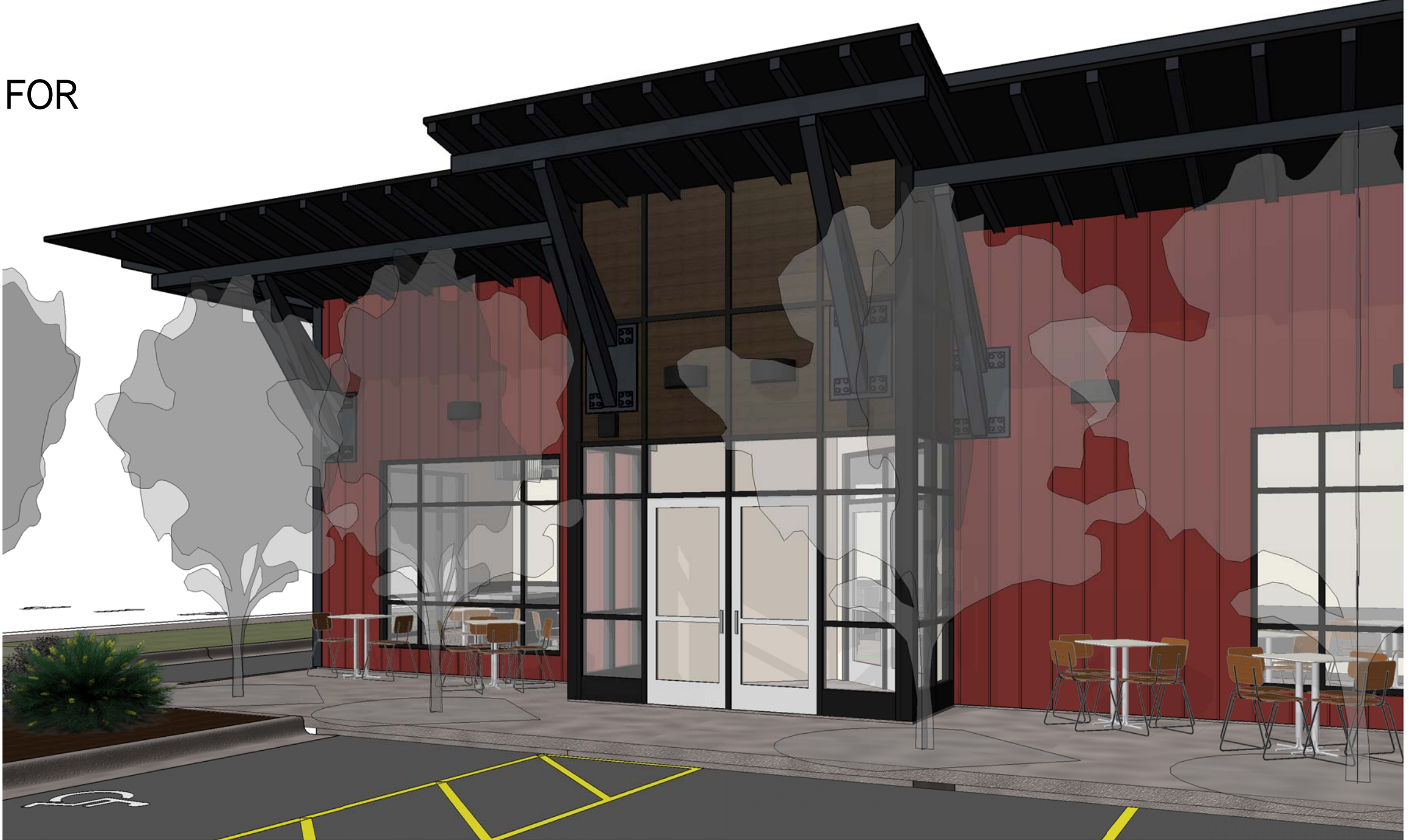
6 ENTRY2 SCALE: