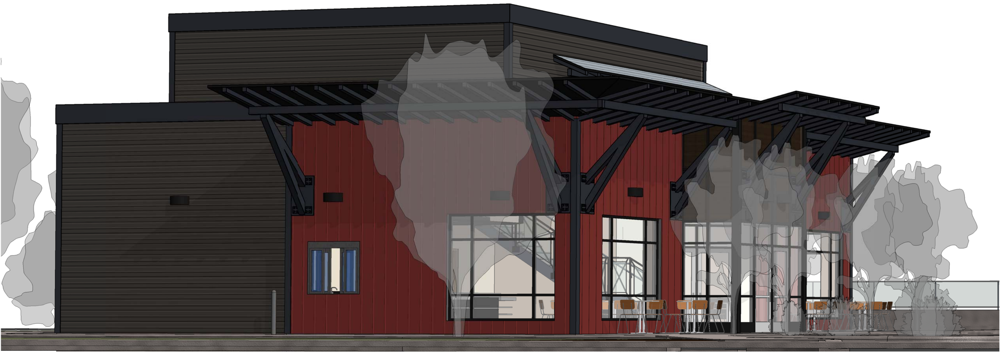
3 LOOKING EAST SCALE: