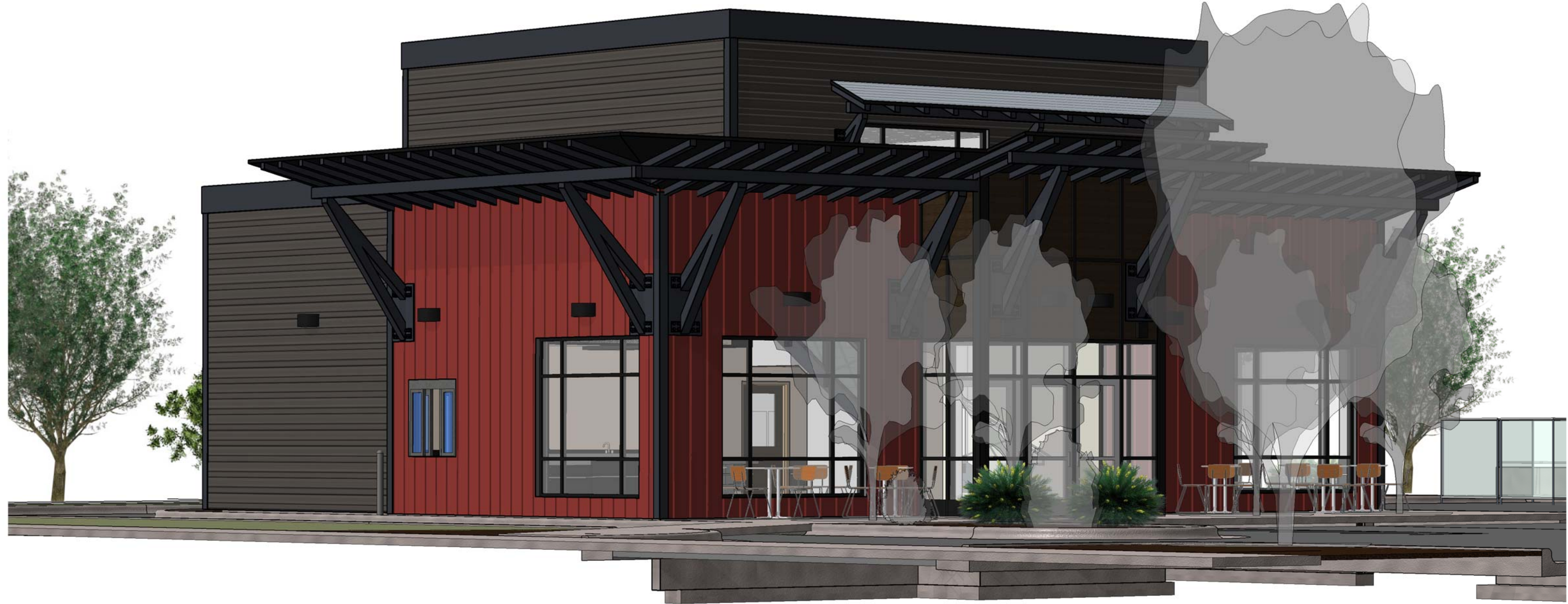
1 LOOKING NORTHWEST SCALE:

0:\Projects\1889 Cafe\Drawings\1889 Cafe.rvt (9/20/16) 9/20/16 7:18:26 AM