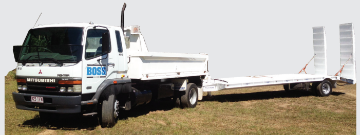
Mitsubishi Fighter FM10

3M - 10M Tippers Truck & Dog Semi Tipper Single & Triple Axel Tag Trailers