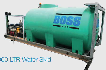
7000 LTR Water Skid

1500 LTR Water Trailer 7000 - 45 000 LTR Water Trucks 7000 LTR Water Skid