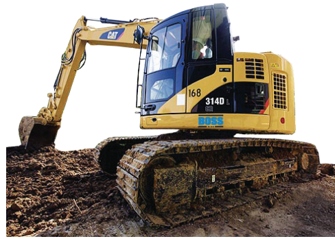
314D 14T Cat