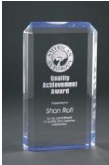
Self Standing 4 ¾" x 7 ½" $75 each **