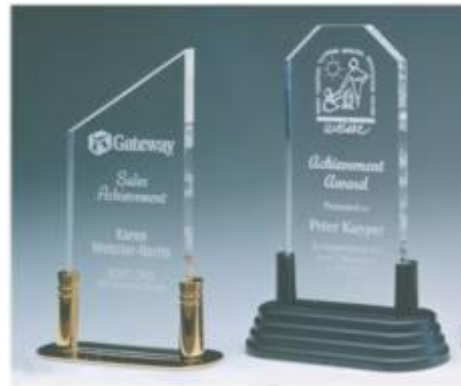
Acrylic Pop-Up 7" x 3" $38 each Black Base $45 each Brass Plate Base**

** ($25 logo setup charge if requested per order) Plus S/H charges