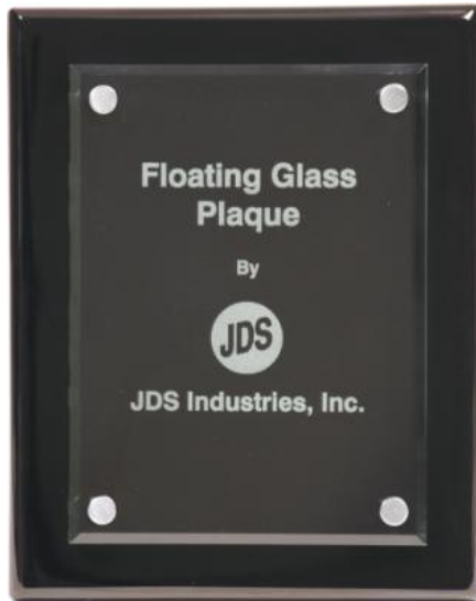
Piano Black w/ Floating Glass 9" x 12" $90 each **