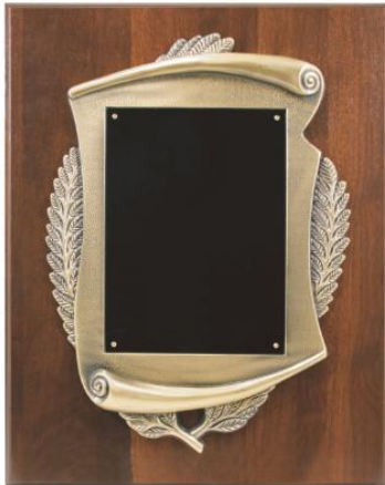
Large Scroll 8" x 10" - $55 each ** 9" x 12" - $65 each ** 12" x 15" - $82 each **

** ($25 logo setup charge if requested per order) Plus S/H charges