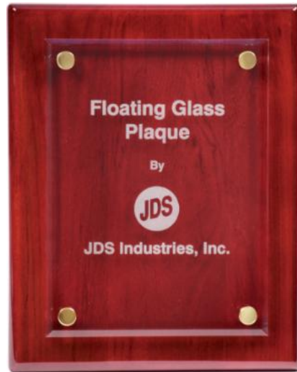
Piano Rosewood w/ Floating Glass 9" x 12" $90 each **