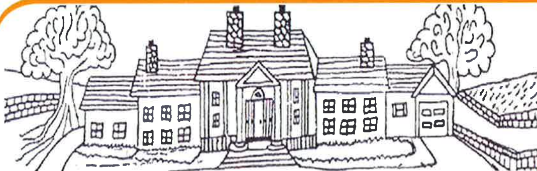
THE TAX ASSESSOR