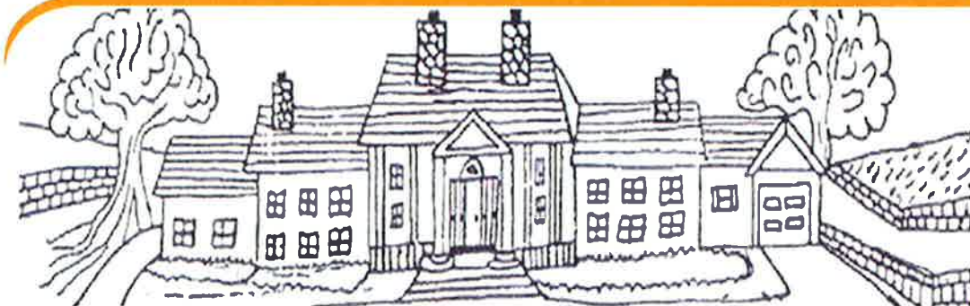
THE TAX ASSESSOR